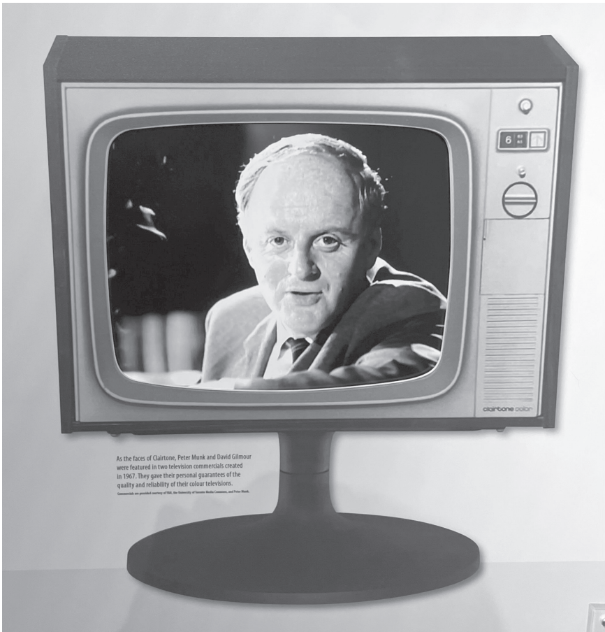
Peter Munk on a Clairtone TV, Museum of Industry, Nova Scotia.