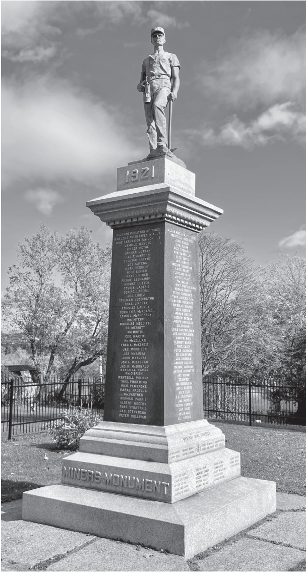
Miners' Monument, Stellarton, Nova Scotia.

of explosive methane gas and coal dust that employers and government officials ignored repeatedly. 38