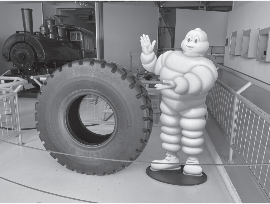
Michelin Man exhibit, Museum of Industry, Nova Scotia.