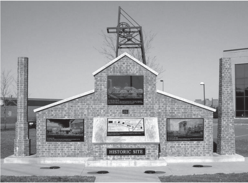
Sobeys Industrial Monument, New Glasgow, Nova Scotia.