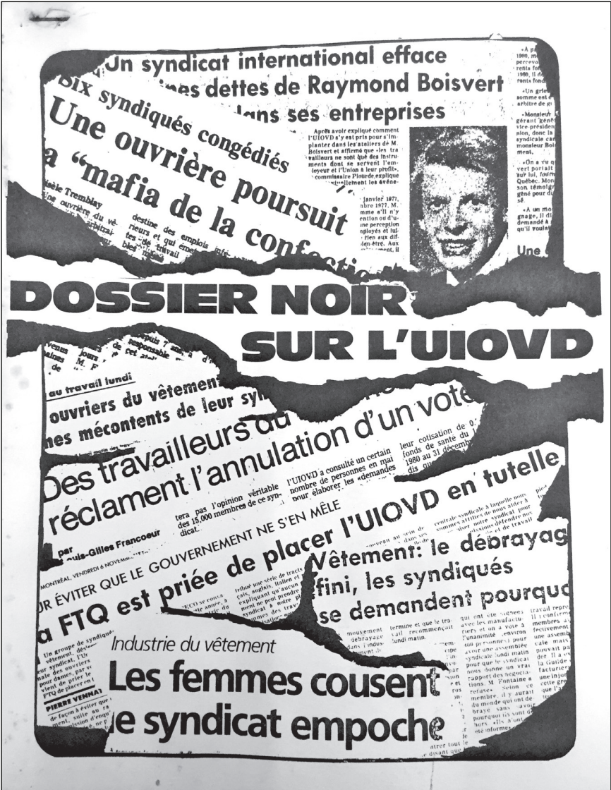
The Dossier noir sur l'UIOVD. Comité d'action des travailleurs du vêtement, "Dossier noir sur l'UIOVD," 4 November 1981.