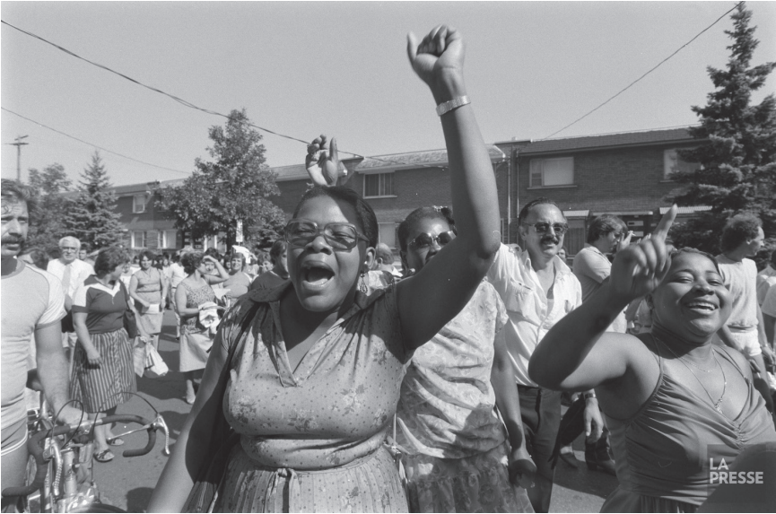
Garment workers on strike in Montréal's Chabanel garment district.