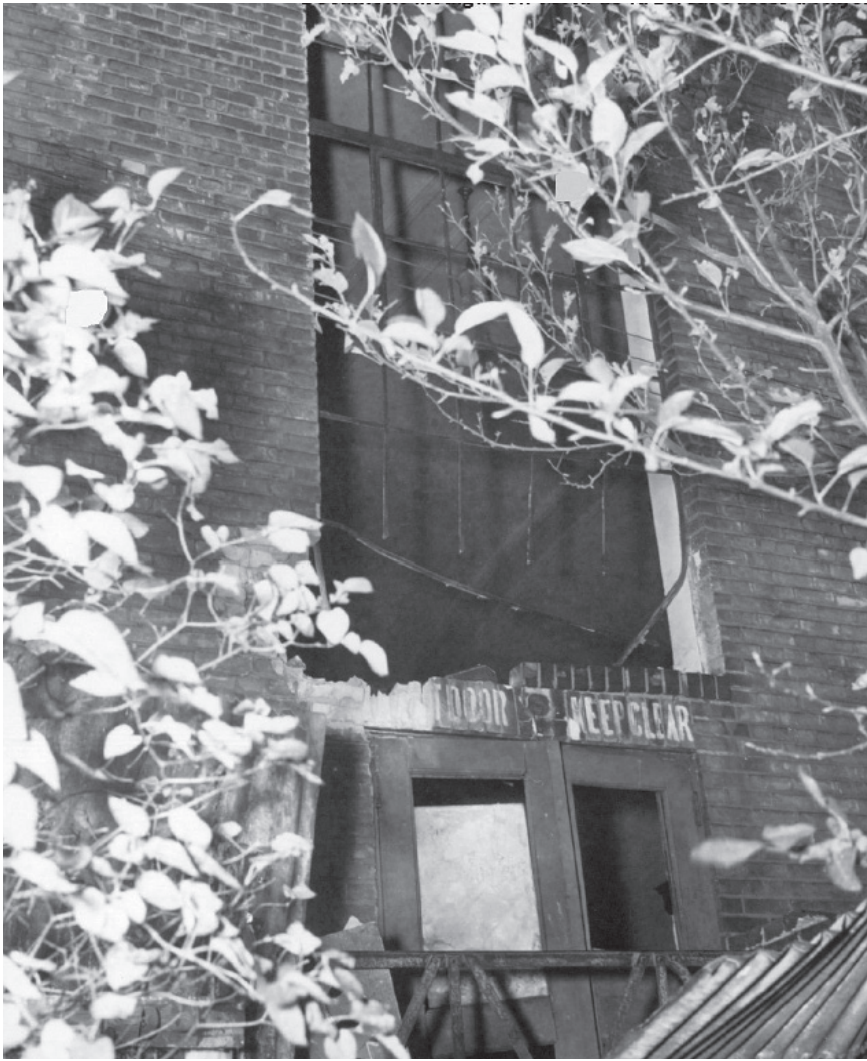
View from where investigators believe the bomb was placed, n.d.

Unlike in Edmonton, the officers could not dismiss this explosion as a stink bomb. They determined that it was either dynamite or nitroglycerine and had been ignited by a fuse and detonator cap. The investigators believed that the explosive had been placed outside, near a fire escape, which was easily accessible from a lane near the back of the building.