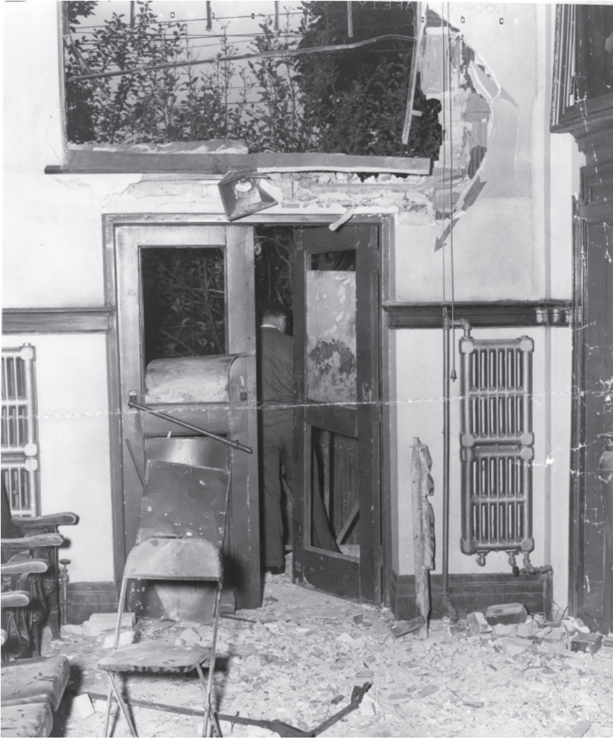
A close-up of the damage, n.d. © Government of Canada. Reproduced with the permission of Library and Archives Canada (2022).

Royal Canadian Mounted Police fonds, vol. 2623, access request A-2015-00092, Library and Archives Canada.