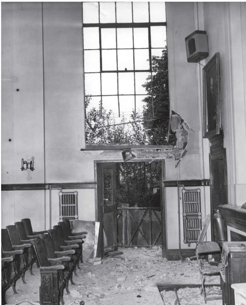
The Labour Temple in the aftermath of the bombing, n.d. © Government of Canada. Reproduced with the permission of Library and Archives Canada (2022).

Royal Canadian Mounted Police fonds, vol. 2623, access request A-2015-00092, Library and Archives Canada.