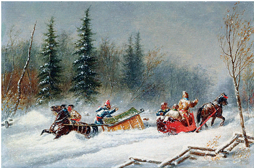
The maintenance of winter roads was instrumental for the highway system of New France. Cornelius Krieghoff, Run Off the Road in a Blizzard , n.d. [19th century], oil on canvas.