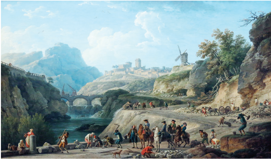
Claude-Joseph Vernet, La construction d'un grand chemin , 1774, oil on canvas.

Musée du Louvre, Paris.