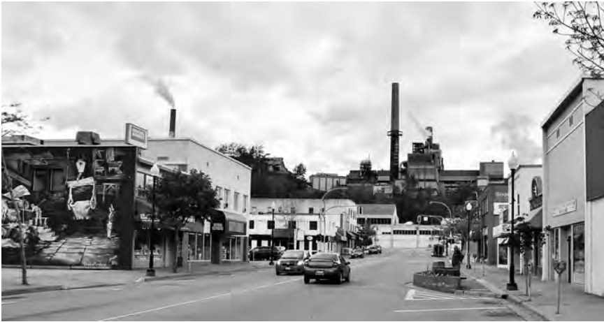
Trail today with Cominco smelter overlooking the city. Mural (left) shows lead furnaces where many workers suffered industrial diseases such as lead poisoning.