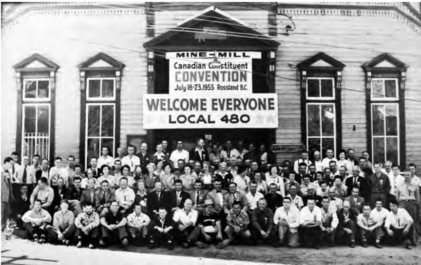
Local 480 hosted the founding convention of Mine-Mill Canada in the historic Rossland Miners' Union Hall, built by Local 38 of the Western Federation of Miners, Mine-Mill's predecessor, in 1898.