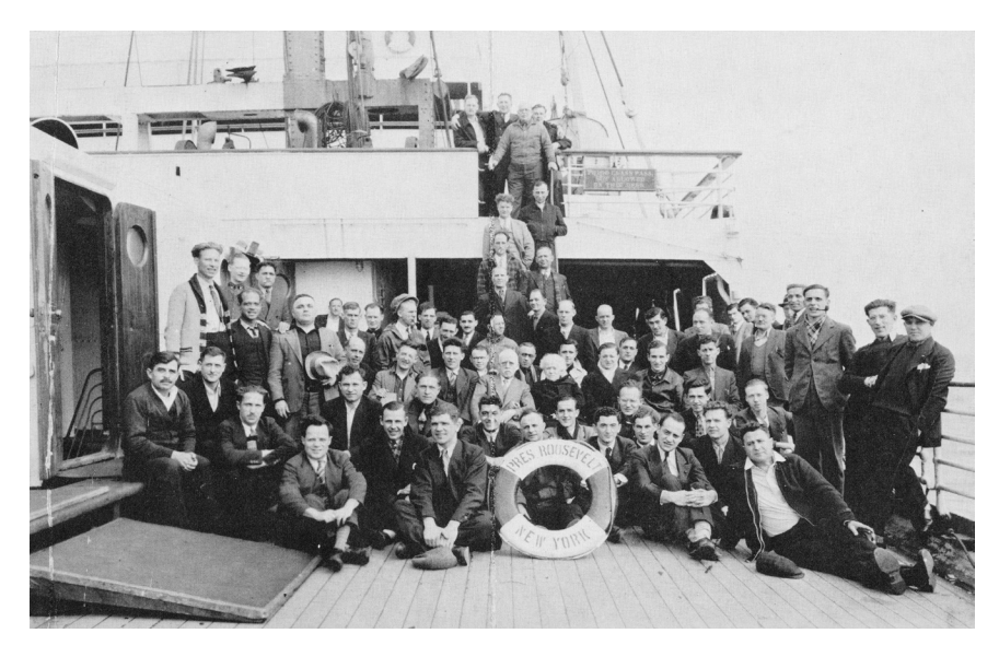
Canadian and American volunteers, although travelling in secret, gather for a group photo on the deck of The President Roosevelt during their transatlantic crossing in February 1937.