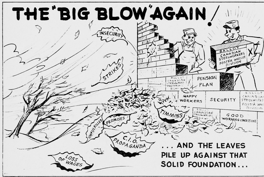
Employer-sponsored cartoon depicting corporate welfare as indicative of the advantages of the Canadian Steelworkers (Foster Wheeler Division) over industrial unions, the Canadian Steelworker Foster Wheeler Division , October, 1951.

Courtesy of Brock University Library, Special Collections and Archives.