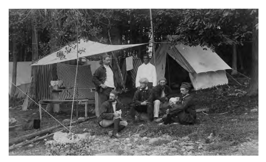
Figure 3. S.R. Stoddard, "The Sneak-Box Mess: Camp of the Brooklyn Canoe Club," 1887.

and Knickerbocker men who belonged to his mess: 'Breakfast, Morcans! Niggerboggers, breakfast! Dod rat them sleepy Yankees!"<sup>73</sup> A loud, bossy cook from the shanties may have fulfilled the canoeists' desire for an authentic outdoor experience. However, such representations also reinforced the cook's position as other within the white middle-class world of the encampments.