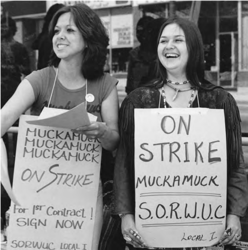
SORWUC members picket the Muckamuck.

seemed the only solution. On 28 May, a majority of the workers voted to strike and on 1 June, the Muckamuck job action officially began.