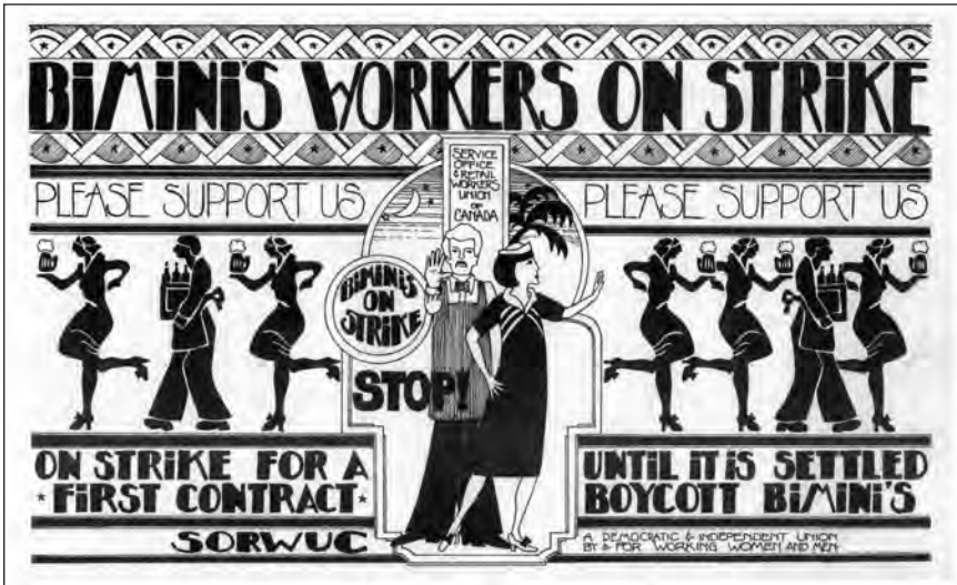
SORWUC sign from the Bimini strike.