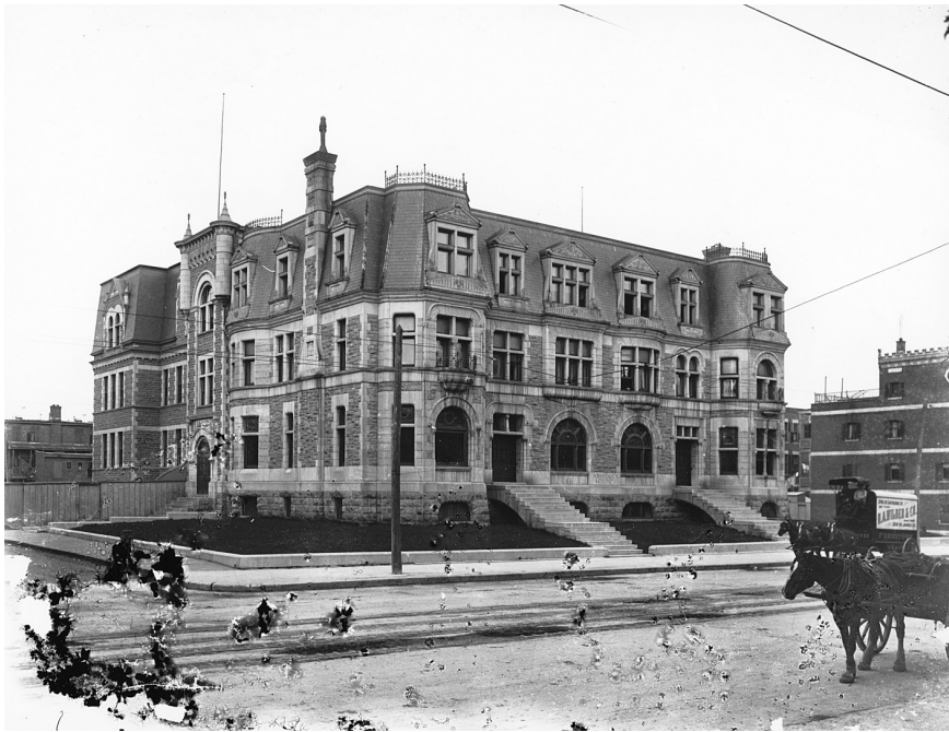
Figure 1. N.M. Hinshelwood, "Aberdeen School," c.1900.