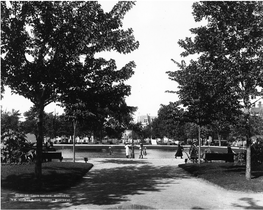
Figure 2. William Notman & Son, “St Louis Square, Montreal,” c.1895.