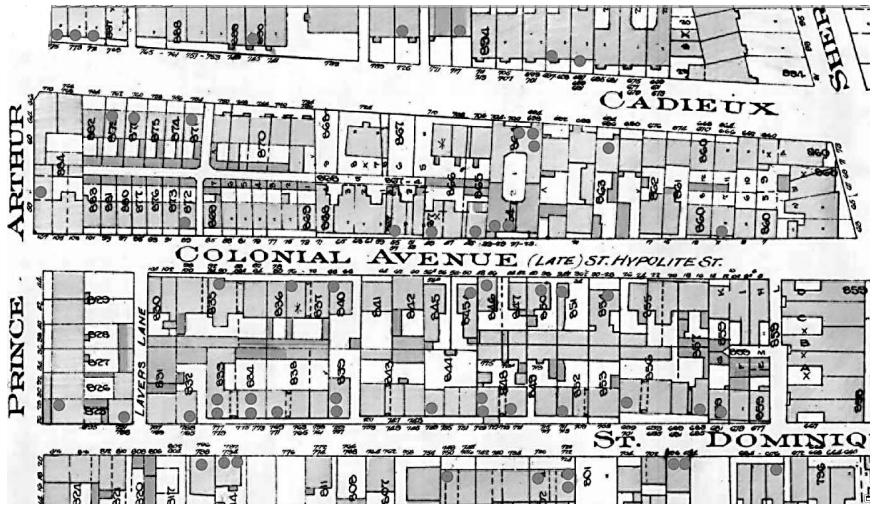
Figure 4. Households sending one or more students to Aberdeen School, 1912-13. Adapted from Charles E Goad, Atlas of the City of Montreal and vicinity , 1912.