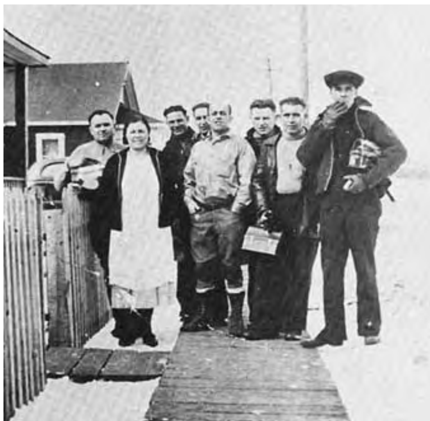
A Coniston Ukrainian boarding house operator and her Ukrainian boarders, circa 1930.

were cunning or abusive; memories of boarding houses as sites of pleasure alongside those that spoke to danger.