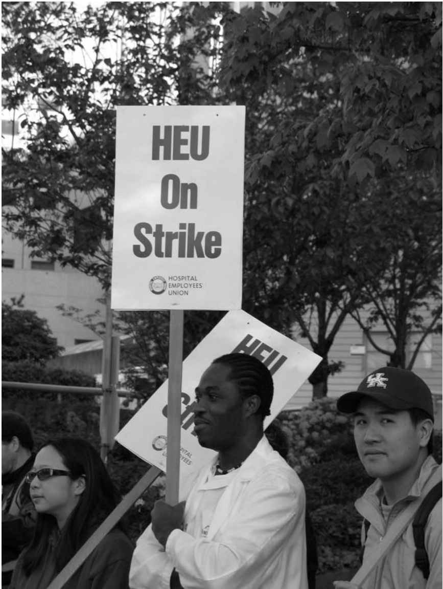
Outside of Vancouver General Hospital, 27 April 2004.