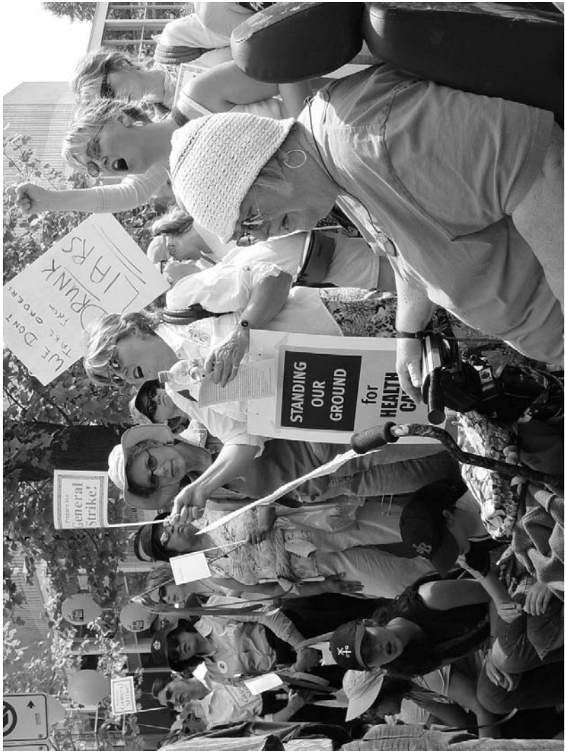
On the lawn in front of the Vancouver Art Gallery at May Day rally, 1 May 2004.