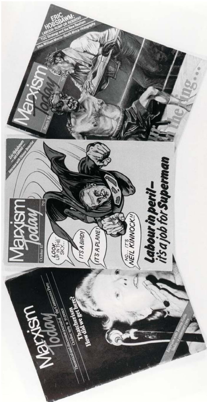
The new second format of Marxism Today was more in keeping with the format of contemporary news-magazines, starting with the October 1979 issue (left). In the aftermath of Labour's disastrous general election showing in June 1983, Eric Hobsbawm's feature articles, "Labour's Lost Millions" and "Labour: Rump or Rebirth?" published respectively in the October 1983 (centre) and March 1984 (right) issues, were critical interventions which provoked intense debate over the Labour Party's future.