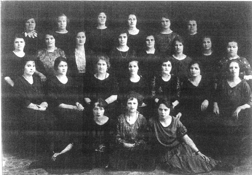
Department of Working Women, East Kildonan, Manitoba.

within the Party itself. Many Ukrainian Canadian women who read Robitnytsia did come from rural backgrounds, or were initially illiterate, yet a reading of their newspaper, produced for and, occasionally, by them, reveals an early experiment in gender and class consciousness-raising that remained unique in the history of the North American Left.