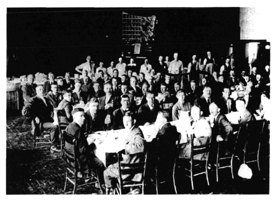
Members of the Citizens' Committee of 1000 at a Banquet After the Strike. C. 1919.

An Action from which it may be apprehended that this Constitution and this form of Government is to be attacked must be an occasion for the performance by this Government of its full and unquestioned duty to protect its laws and its own dignity, and thus to protect the subject, by retaining for him that Constitution which for 200 years has been the wonder of the world and the proudest boast of the Englishman.<sup>33</sup>