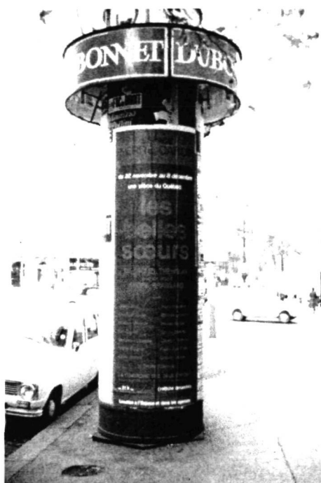
Publicity column in a street of Paris advertising Michel Tremblay's play.

Most Parisian critiques gave a more or less lengthy summary of the play, something many did not do in Québec. The reviews of the play itself went from one extreme to another. For some, the play was just about a bunch of women sticking grocery stamps in booklets while gossiping and insulting each other; 65 and for others, it was a social study of the popular classes in Montréal, and more specifically a study of the fate of women living in difficult conditions. 66 Still, for most, it was a political statement about Québec liberation and sovereignty, as Michel Tremblay stated in his Parisian interviews. Though most reviewers stressed the "local flavour" of the play, a few recognized its universal aspects, linking it to the conditions