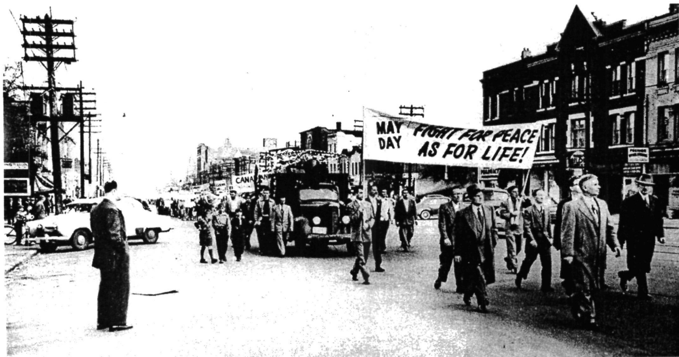
Figure 2. "May Day Parade, c. 1951." Kenny Collection, Fisher Rare Book Room, University of Toronto. As found in Rosemary Dunegan, Spadina Avenue (Toronto 1985), 147.