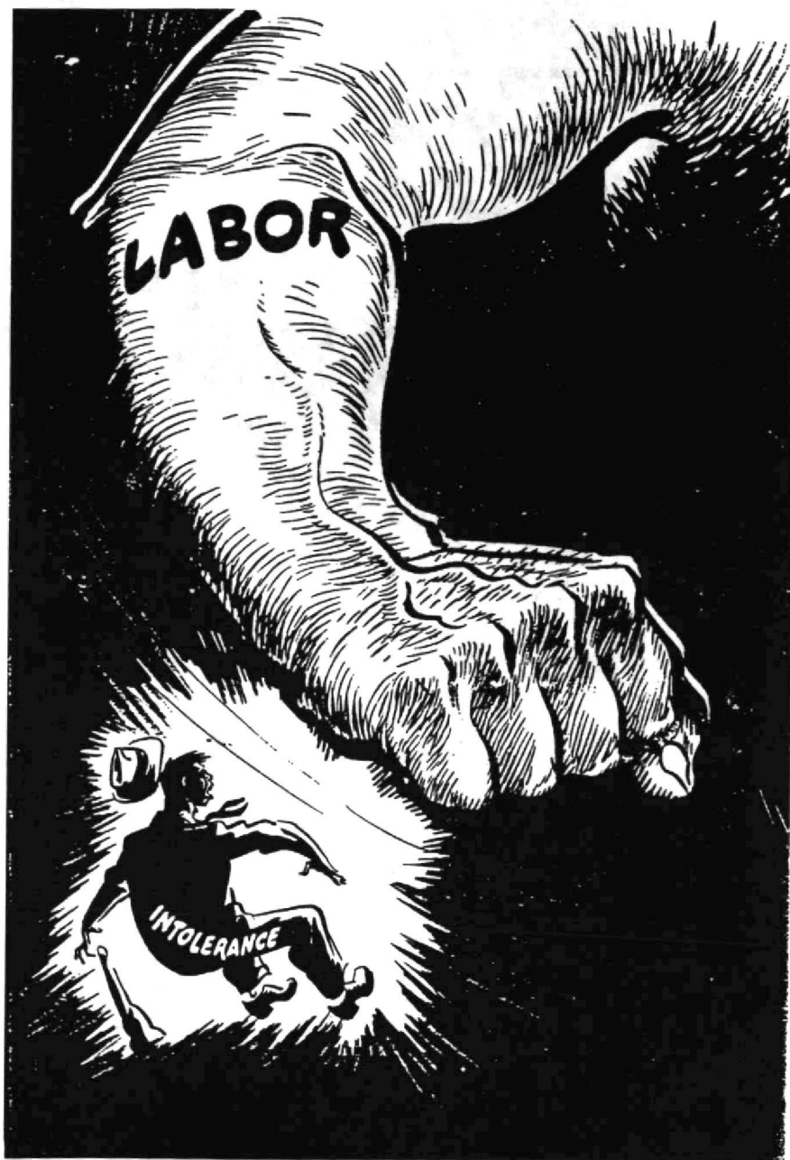
Canadian Labour Reports.