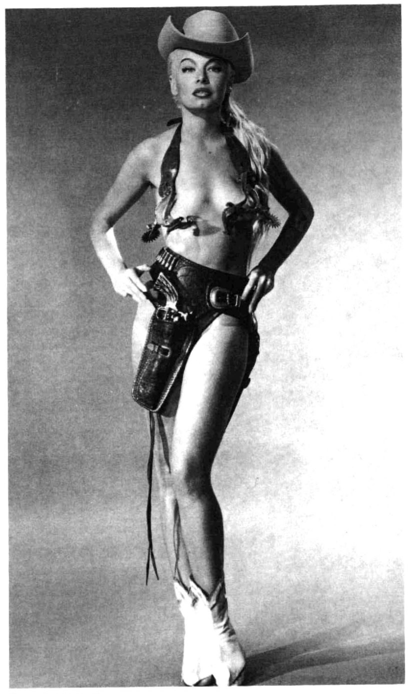
Figure 3: Lili St. Cyr