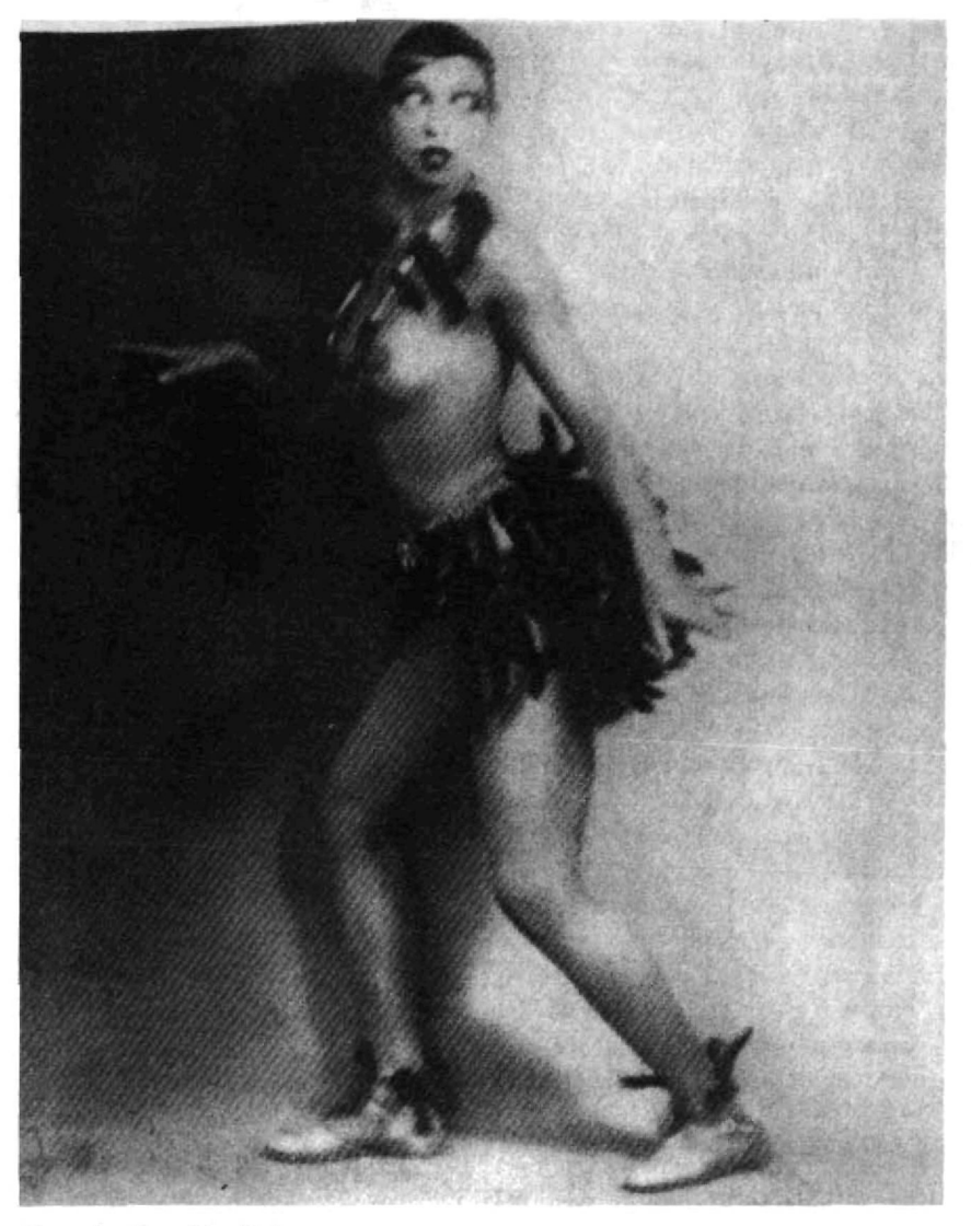
Figure 1a: Josephine Baker

later appeared in Vancouver in the 1950s. Cast in the show, "La Revue Negre" as a "tribal, uncivilized savage" from a prehistoric era, hence consigned to "anarchronistic space," Baker was rendered intelligible and digestible to white Parisian voyeurs.<sup>84</sup> Narrating the fantasy of the jungle bunny — the oversexed object of both white European fascination and repulsion — she danced in banana skirt and