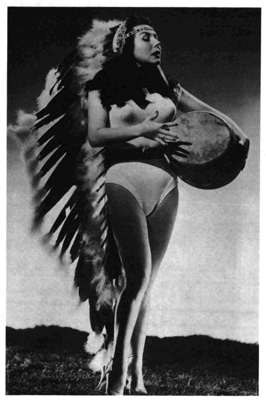
Figure 2: Princess Do May