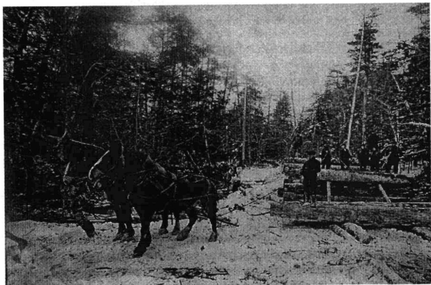
In the Bush