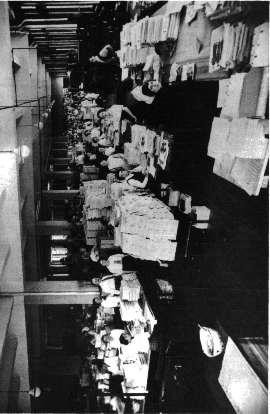
Methodist Publishing House, "Busy Bindery," Archives of The United Church of Canada, Toronto.