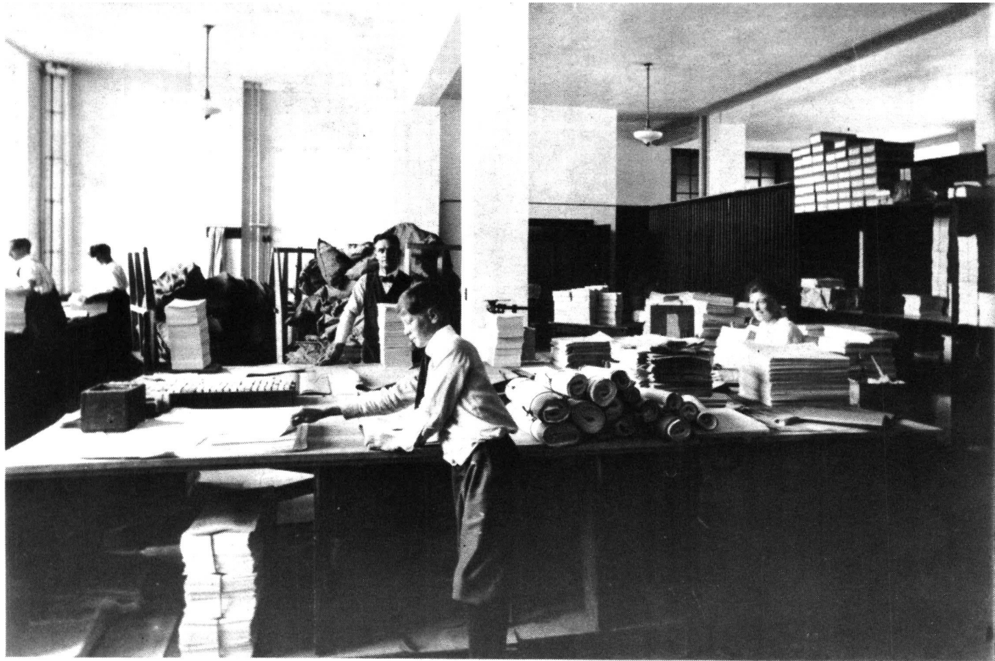
Methodist Publishing House, Corner of the Mailing Room, Archives of The United Church of Canada, Toronto.