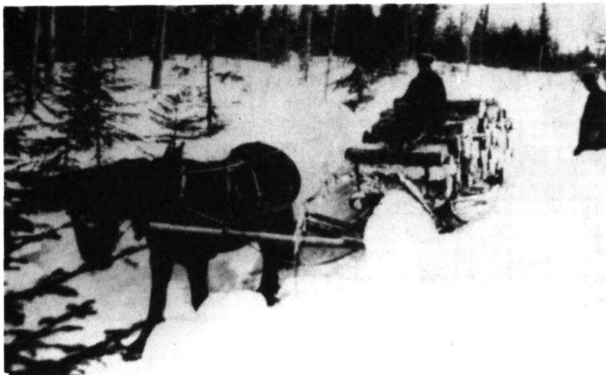
Hauling with a single team.

The...concession was arranged in order to help out lumbermen who will remain in the camps one month, and avoid their having to look for passes through the Relieving Officers and others if they are fortunate enough just to break square. It might help to make the men more contented and will keep them off the dole at any rate for a month if they will remain. 33