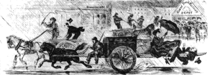
1. ON THE ARRIVAL OF TRAINS.