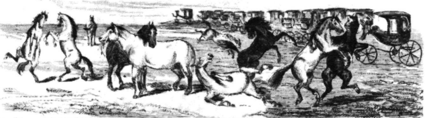
6. A RECEIPT FOR TREES.

The Cabman's Strike, Canadian Illustrated News, volume 3, 13 May 1871, p.300.