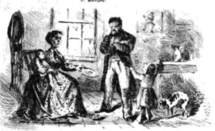
5. THE POOR CABMAN'S HOME.