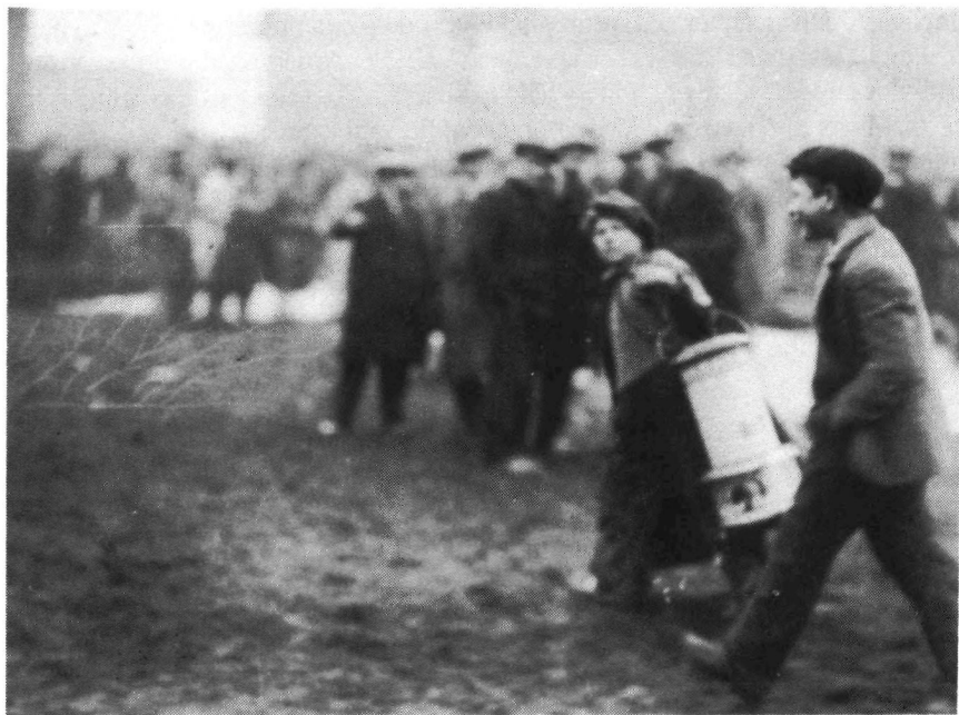
Boys carrying away oil stove during riot at Colonial Building, April 1932.

administration's alleged wrongdoing. The day before the opening of the House of Assembly on 5 April a meeting was organized in St. John's by the merchant elite, including Eric Bowring and W.S. Monroe. The following day a "monster parade," headed by the Guards band and including "prominent business men, doctors, legal men and a large number of women" as well as "ex-service men, naval reservists and members of the Merchant Marine," marched to present a petition to the government. 101