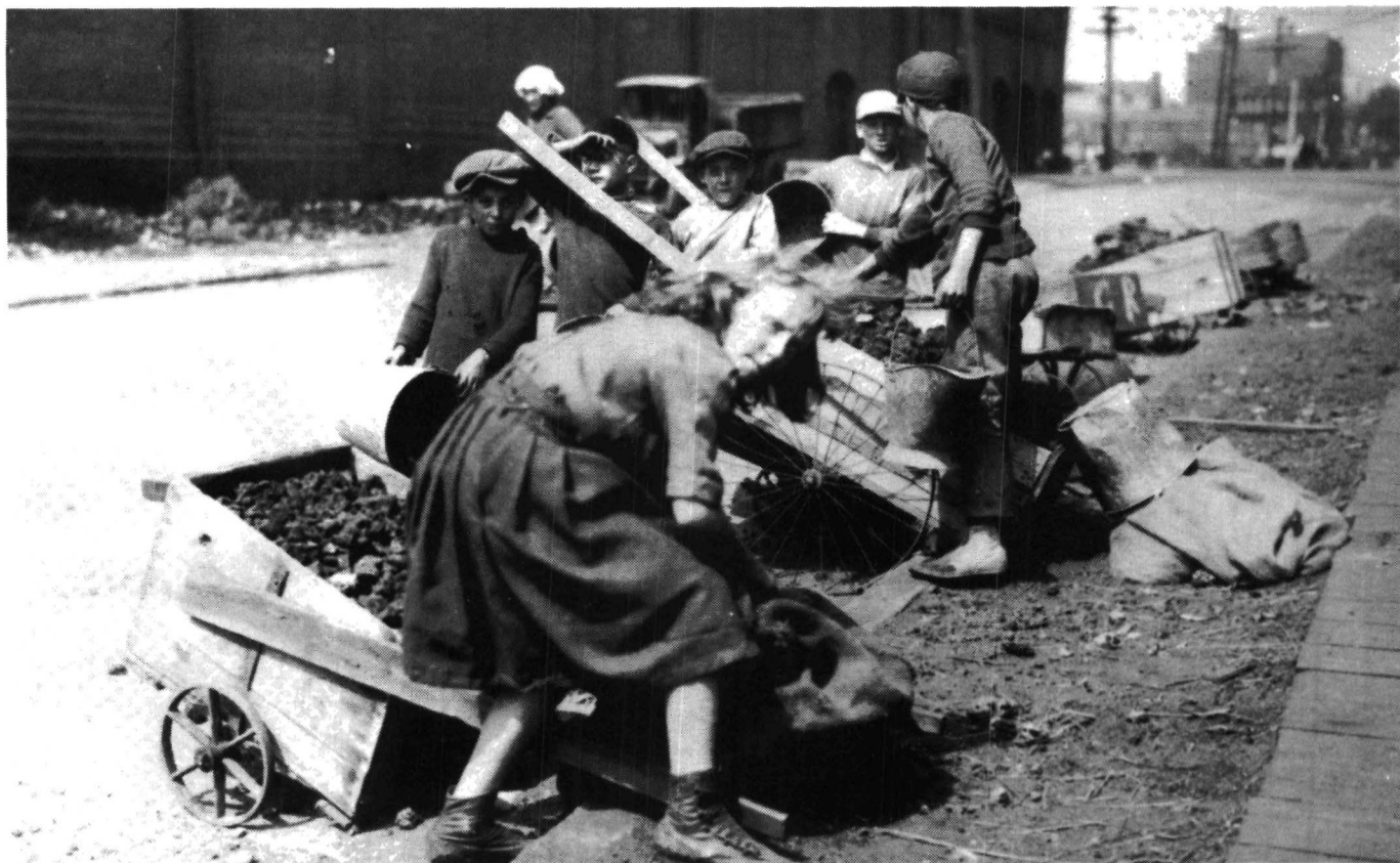
Toronto children picking over cinders, discarded by the Gas Company, for use as fuel: 31 August 1923.