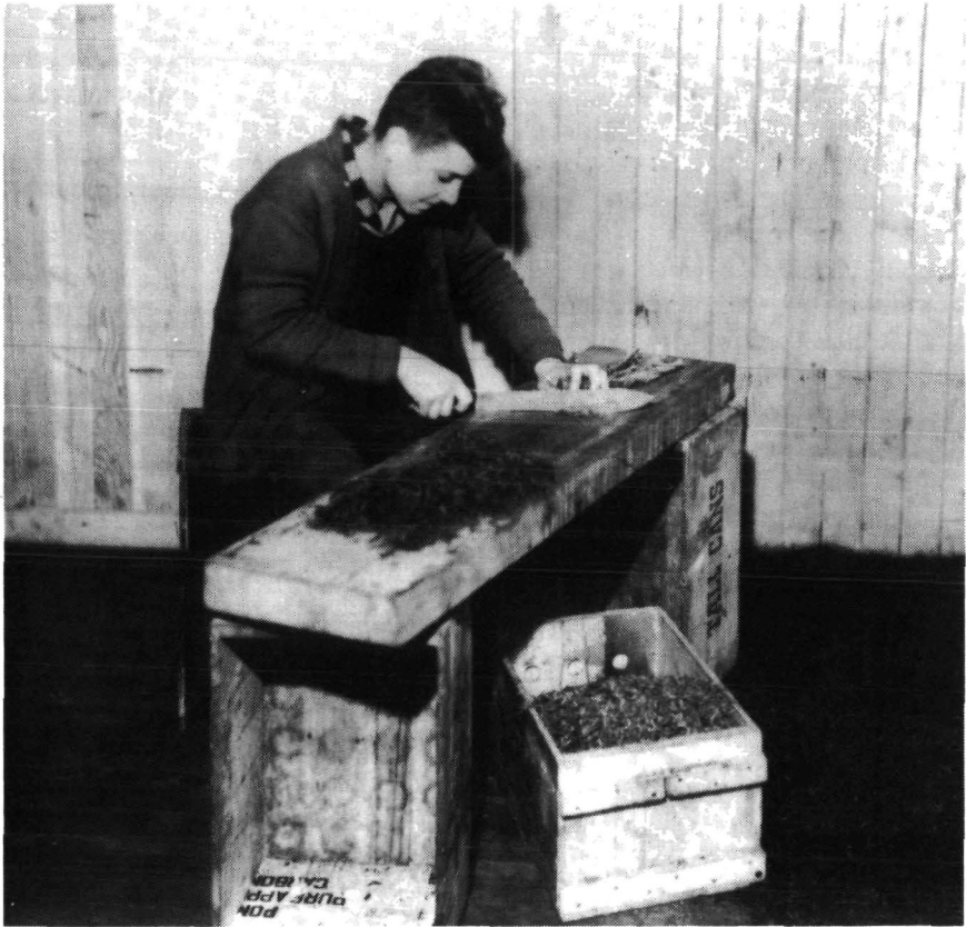
A youth - perhaps just old enough to leave school - cuts tobacco at the Jack Canuck Tobacco Company: Vancouver, September 1931.

full-time at housekeeping and child care. As a Cedar Cottage woman pointed out, "our life was very ordered. Mom stayed at home, Dad went to work, and kids did 'kids' things.'" In both classes, "kids' things" included attending school regularly. 13 As early as the end of World War I, middle-class families commonly expected children to complete junior matriculation at least. "There was," reported one woman, "a Kerrisdale tradition of a lot of high school graduates [and] about a quarter going on to university." In the 1920s, working-class families generally expected their children to complete their "entrance" examinations. Then, as they approached school-leaving age, they and their parents began the search for a job.