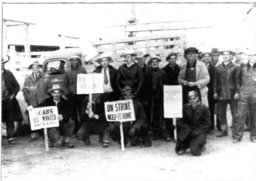
Farmer pickets at Olds during Alberta Farmers' Union delivery strike, blocking Mountain View Livestock Co-op yard, Sept. 23, 1946.