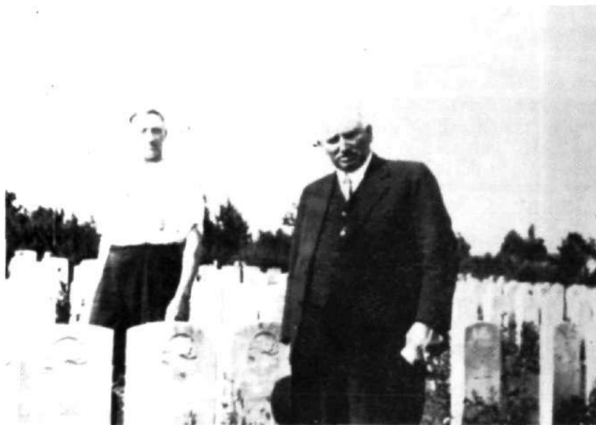
William Coaker.

future, the prospects of the present year should not have been jeopardized." 45 An ordinary strike held up production only for its duration, added the Trade Review , but this one nearly cost a year's effort — which, of course, was precisely the point, since the sealers could hardly have acted before coming to St. John's, and indeed might not have struck at all but for the reported future price reduction. 46 A better comparison would have been agricultural labour disputes, but such disturbances were hardly familiar in Newfoundland.