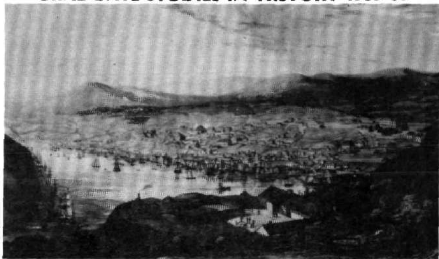
Town and Harbour of St. John's. Taken from Signal Hill, June 1st, 1831