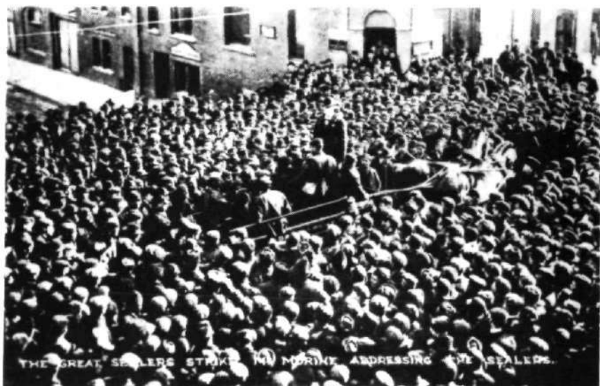
Sealing Strike: Morine Addressing Sealers.