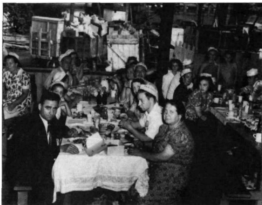
Initiated in 1937, the annual employees' picnic was an important ingredient in the 'Dofasco Way.'