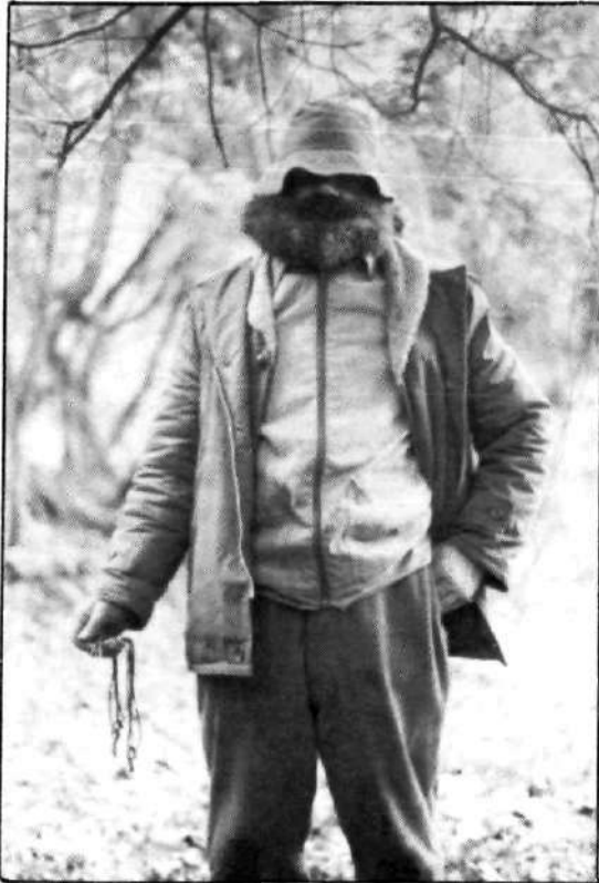
An Unexpropriated Romany Man Holding Rabbit Snares, Worcestershire, Winter 1979

This comes from a somewhat later period but in showing us some of what the Romany knew in order to survive, it can show what others might learn from them. 18