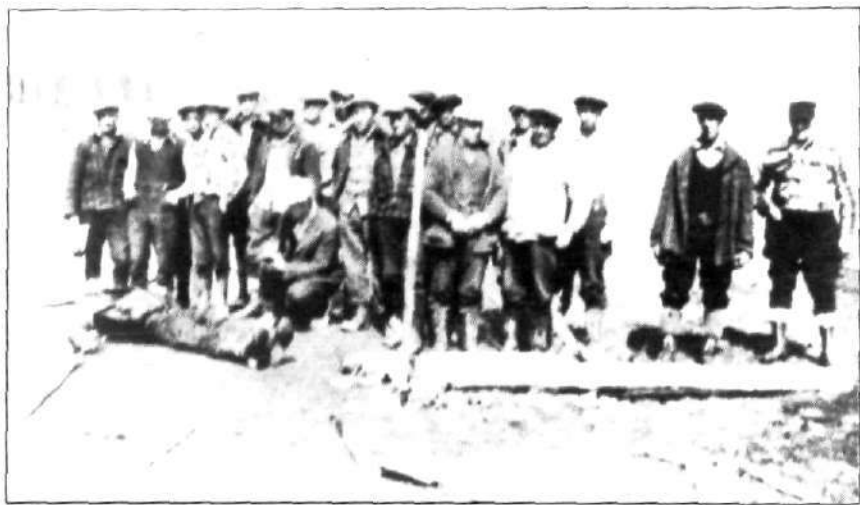
The search party with body.

The disappearance of Rosvall and Voutilainen was the final misfortune that broke the Shabaqua strike. It was called off by the LWIUC on 17 December. It had reached none of its objectives, and had generated the usual counter-reaction among the employers: known union men found themselves black-listed. 35 Over the long winter months that followed only the search party patrolling Onion Lake kept the case of the missing unionists alive. Then on 19 April, after the spring thaw had begun to melt the rivers and the lakes, the body of John Voutilainen was found.