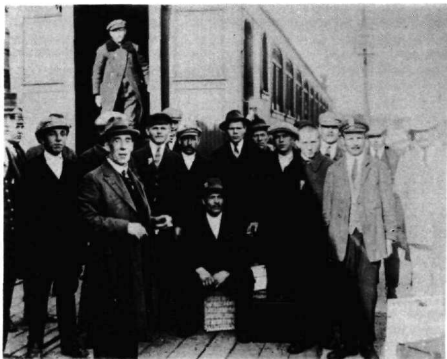
Men in front of a train car.

Cordasco then was probably a nasty man and certainly did not deserve the excess profits he exacted from the migrant labour force, but he did, except perhaps in spring 1904, do his job. The historical literature has too often assumed that the male sojourners of the 1890s and 1900s were helpless victims of the system, potential settlers held in thrall by the padroni and condemned to exploitation and to transience by his machinations. At least in the Canadian case, that was simply not so.