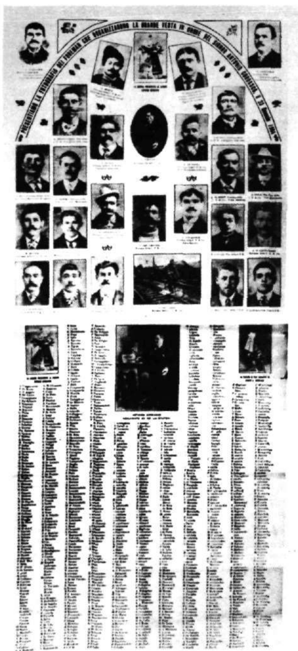
Cordasco's Souvenir Sheet. The men in the top of the photograph are his "marshalls" or sub-bossi. (A.V. Spada, "The Italians in Canada," Montreal, 1969, 87.)