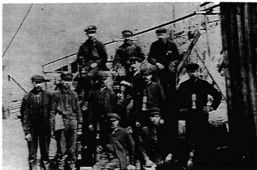
A group of miners using Davy safety lamps in 1910.