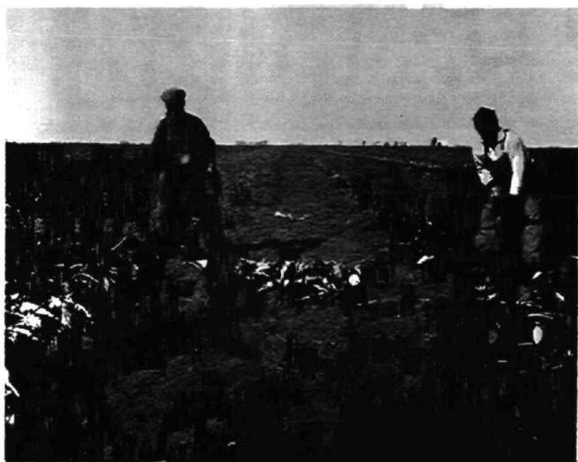
Harvesting sugar beets, 1930's.