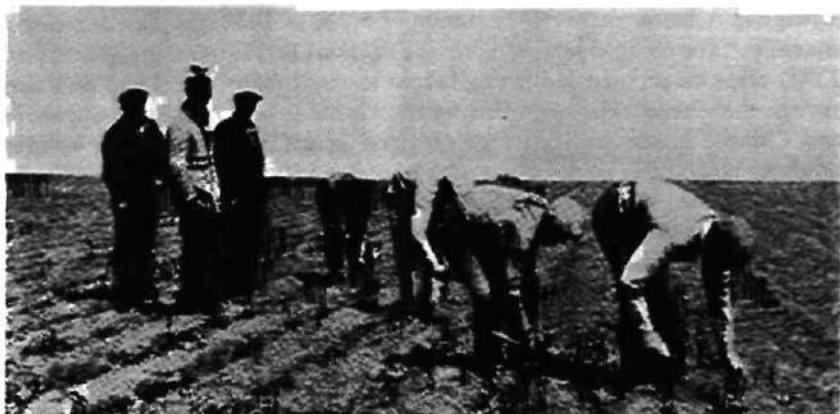
Thinning a large beet acreage, 1930's.