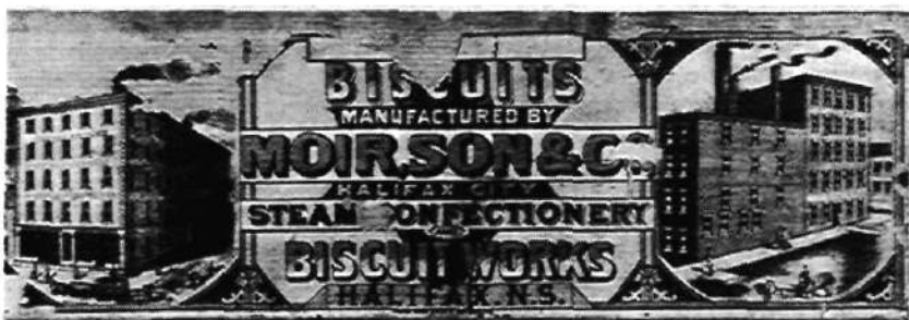
A lithograph on the end of a Moirs biscuit box shows the size of the factory c. 1890.

Moirs alone of the Halifax baking and confectionery establishments became a factory. With the ropeworks, sugar refineries, and cotton factory, Moirs was evidence of Halifax's growth as an industrial city. In at least one sense Moirs was more important than the other industries: it remained in the city as a flagship of indigenous capital and survived the initial onslaught of the merger movement. 27