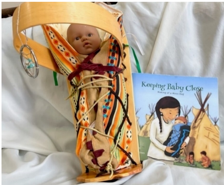
Figure 4. Child-sized Moss Bag, Cradle Board, and Picture Book