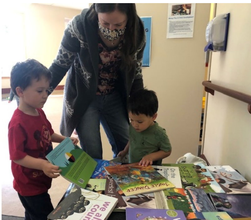
Figure 5. Preschoolers Choose Picture Books to take Home (used with permission)