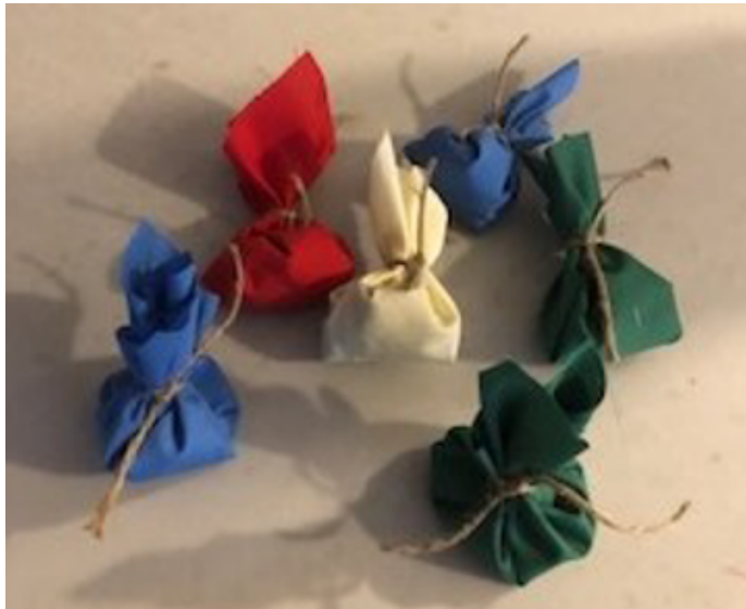
Figure 1. Tobacco Pouches as Cultural Protocol

discussion (Wilson, 2008) where the Advisory Circle had the final say in how study results were analyzed, interpreted, written, and shared to ensure they remained true to the voices of participants, true to cultural values, beliefs, and ways of knowing, that contributions were acknowledged and credited (collective or individual), and that sacred knowledge remained protected. As well, all aspects of the research project were conducted in accordance with the ethical standards set out in the Tri-Council Policy Statement: Ethical Conduct for Research Involving Humans (TCPS, 2022).