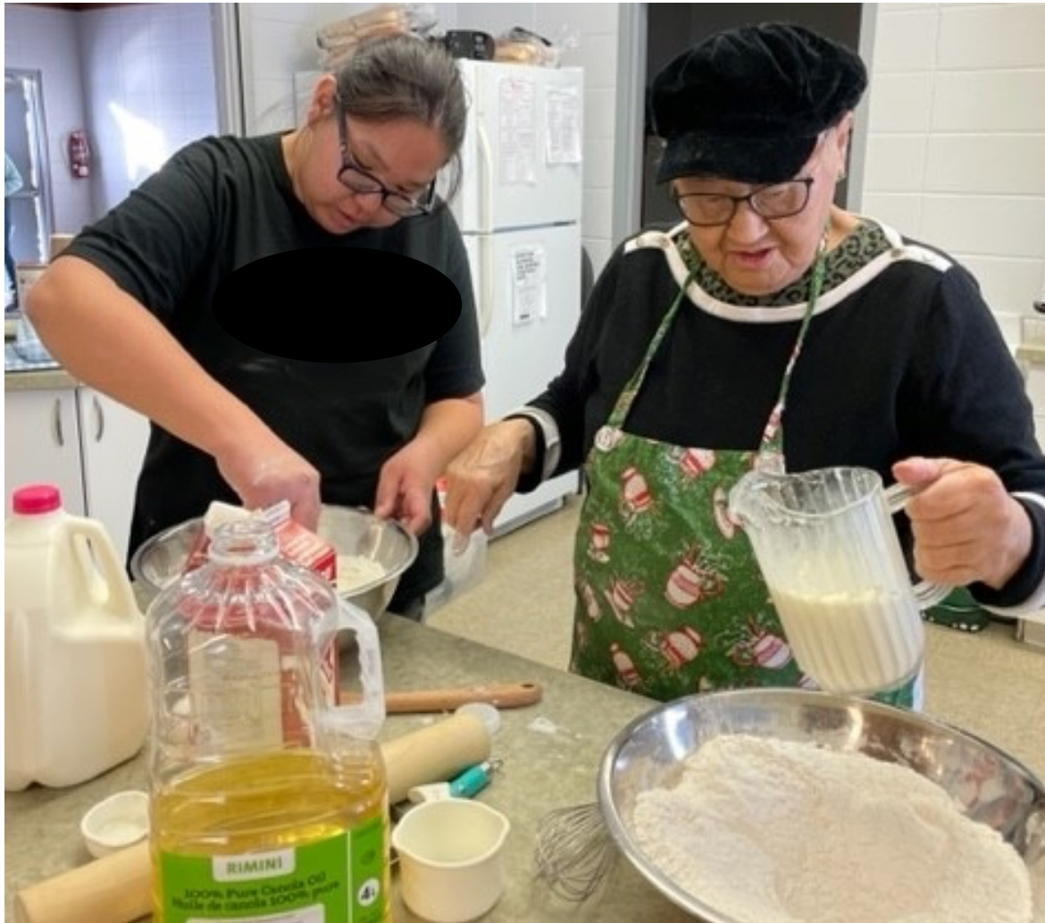
Figure 2. Modelling Bannock Making (used with permission)

Theme three also included recognizing and living embodied knowledge and practices such as oral storytelling and nature/land-based learning. The powerful connection between land and culture (and language) cannot be underestimated in Indigenous ways of knowing and participants shared many ideas related to this connection. For example, CK commented, “I feel like children learn more in nature than they would in school. In school, you have to sit down and learn it, but in nature, they get to go look at lady bugs and talk to lady bugs” (Interview). Simpson (2014) describes the idea of “land as pedagogy” as learning from the land and with the land in the context of family, community, language, and relations, where “if you want to learn about something, you need to take your body onto the land...get involved and get invested” (p. 17-18). Researcher participant observation at the preschool revealed ample, daily outside play and programming where they observed and discussed animals and seasonal changes, examined tree bark and rings, picked berries, talked to trees, and categorized stones as just a few examples. Found nature items were frequently gathered and brought into the classroom to be used in games and art activities, such as tipis, drums, rattles, hoops, rain sticks, or dream catchers, where the oral cultural histories and significance were always explained to the children in ways they could