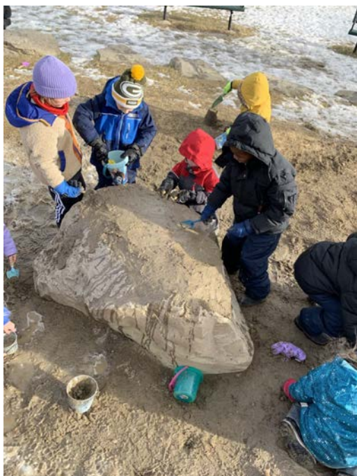
Figure 2. Mudding the Big Rock