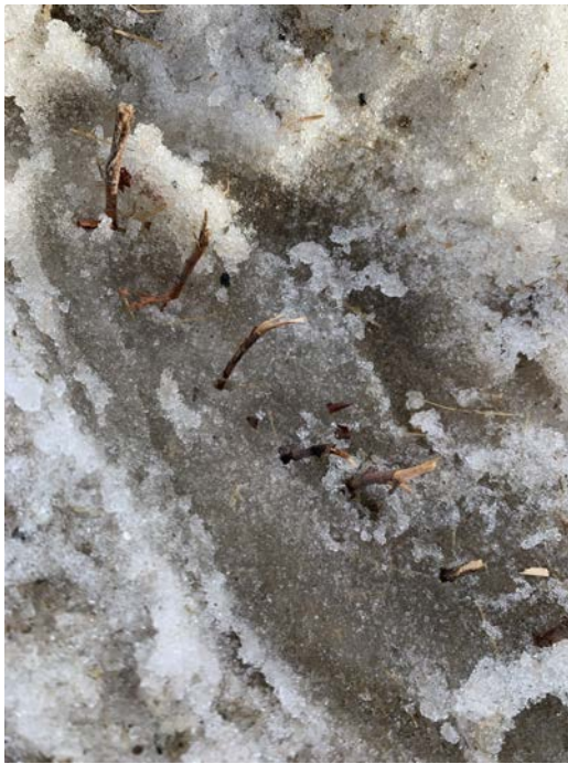
Figure 3. The Worm Garden

The worms are enjoying the garden when one worm leaves the group and, while exploring, arrives at the entrance to the pond. The worm cries out in alarm knowing the pond holds too much water for worms and they won't be able to breathe. The other worms mistakenly interpret the cry of alarm as an exclamation of excitement and rush forward along the trench toward the edge of the pond to join their friend. All the worms are now in danger and are being swept away by water from the pond flowing into the trench.