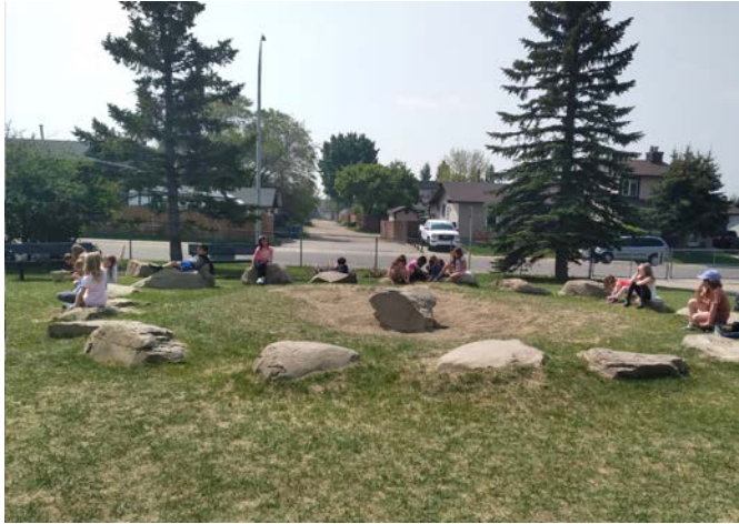
Figure 1. The Rock Circle of the Outdoor Play Space

trip to a community museum and a subsequent encounter with smaller rocks at the edge of the school field, along the fence of a neighbouring home. Following each outdoor play and learning vignette, we include a note that highlights something of Mme. Howard's reflections on or responses to the day's play.