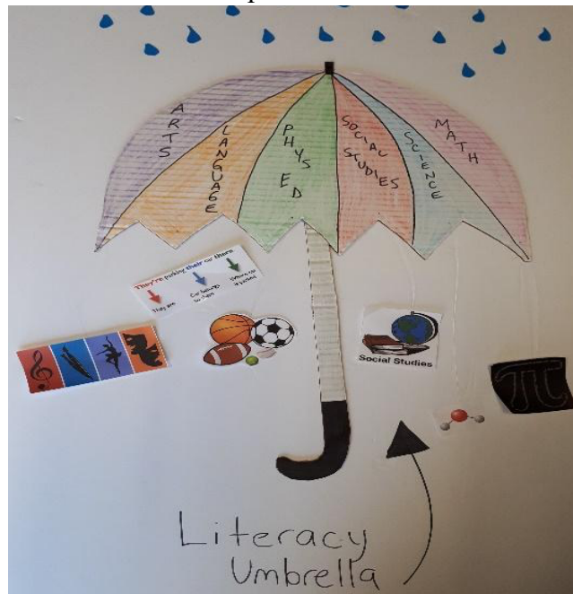
Figure 1. Literacy Umbrella from Participant Oliver’s Visual Journal