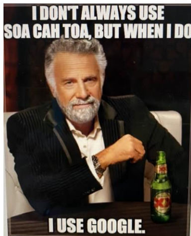
Figure 2. A Meme About Using Google to Understand Math