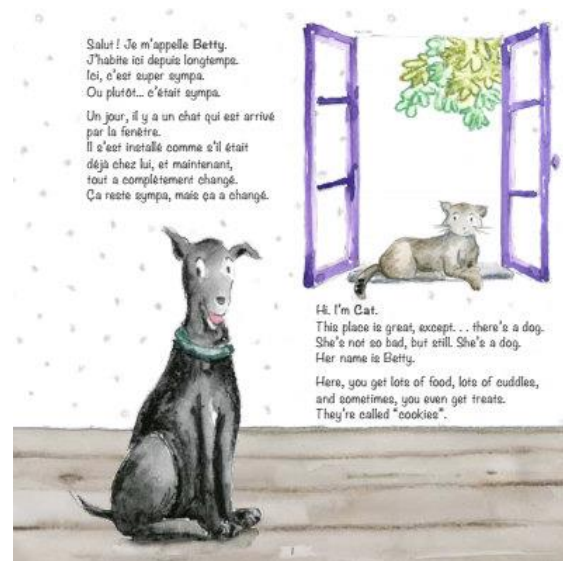
Figure 3. Cover and passage of Chez Betty & Cat at home (Jacobs & Duvernois, 2016)