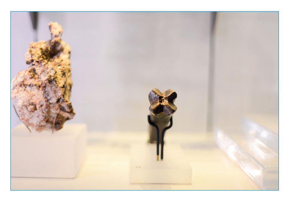
FIG. 4. DRILL BIT CLOGGED WITH GOLD ON DISPLAY IN THE TECK SUITE GALLERY OF GEMS AND GOLD IN 2022.

Like the analyses of landscapes and geological collections referenced thus far, this application of the museological concept of "object biography"—proposed as a method of museum interpretation by historian and museologist Samuel Alberti<sup>35</sup>—also offers productive avenues for critically exploring the architecture of cultural institutions. In the same way that "Mining at the Museum" reimagined mineral specimens in the Teck Suite according to the social, environmental, and economic relations that surround them, this article has traced a critical biography of the ROM Crystal to highlight the extractive practices it contains, conceals,