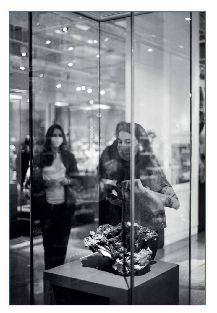
FIG. 3. AUTHOR DESCRIBING A SPECIMEN DURING THE INPERSON COUNTER-TOUR AT THE ROM, 2022.

On June 15, 2022, I was part of a group of researchers from the scholar-activist collective Beyond Extraction, who gathered at the Crystal to lead an unsanctioned tour of the Teck Suite (see fig. 3).<sup>27</sup> The "counter-tour" was developed as part of a growing tradition of "guer-rilla tours" and other forms of activist interventions in museums.<sup>28</sup> Positing that the ROM's entanglement in corporate-extractive interests extends to the uncritical presentation of rocks, gems, and minerals in the Teck Suite and their fetishization through the architectural meta-phor of the crystal, Beyond Extraction opted to reinterpret the gallery for the public in time to coincide with, and thereby resist, PDAC's annual gathering in June 2022. Entitled "Mining at the Museum," the in-person and online counter-tour emerged as a nod to American artist Fred Wilson's 1992 "Mining the Museum," an installation wherein the artist "excavated" objects from the collection of the Maryland Historical Society to highlight the buried histories of Black Americans.<sup>29</sup> In contrast to Wilson's installation, the artifacts on display