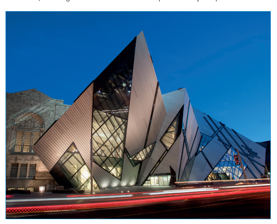
FIG. 1. EVENING VIEW OF MICHAEL LEE-CHIN CRYSTAL, BLOOR ST. ENTRANCE, APRIL 15, 2015. COURTESY OF ROM (ROYAL ONTAIN) MUSEUM). TORONTO, CANADA. ©ROM.

The ROM's vast collections are standard of an "encyclopedic museum," holding nearly one million objects across the realms of natural history, art, and material culture. While the museum is often noted for its impressive dinosaur skeletons or rotating blockbuster exhibitions, the crystalline minerals of the Teck Suite are what captured Libeskind's attention; leading the starchitect to make preliminary "napkin sketches" while attending