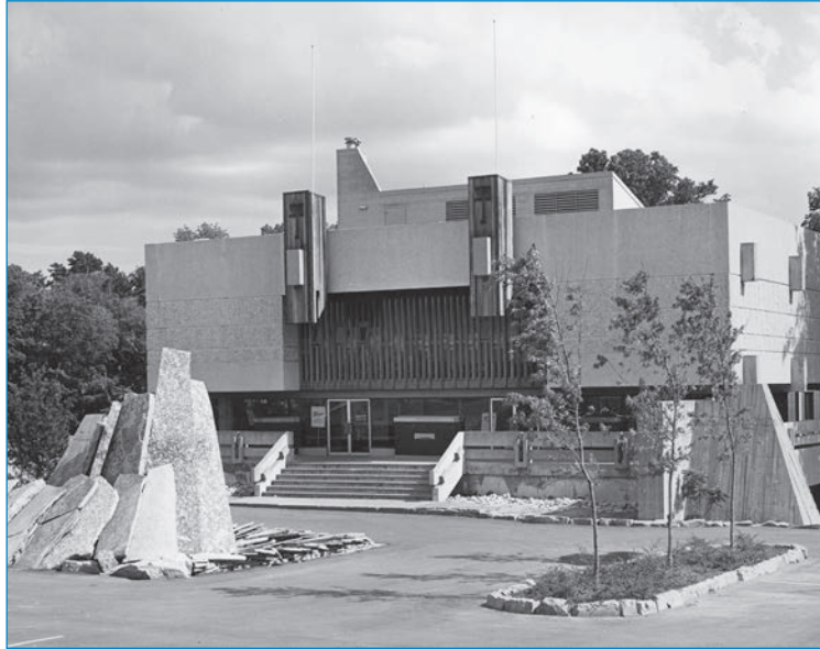
FIG. 2. THE JAPANESE CANADIAN CULTURAL CENTRE, LATER THE NOOR CULTURAL CENTRE, NORTH YORK, ON, C. 1963, BY RAYMOND MORIYAMA. JAPANESE CANADIAN CULTURAL CENTRE 2001.710.