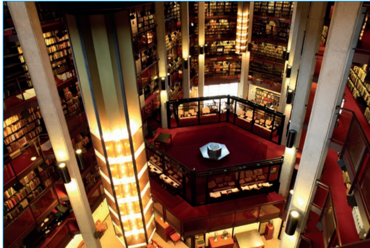
FIG. 6. INTERIOR, THOMAS FISHER RARE BOOK LIBRARY, 2013, BY GORDON BELRAY. COURTESY OF UNIVERSITY OF TORONTO LIBRARIES.

like demolition. At the time of writing, Canada remains the only G7 nation to lack protections for federally significant heritage buildings. 31 Canadian ideas of 'heritage' emerged from an extractive-capitalist paradigm that valorizes rarity—often a side-effect of loss—and assumes that most buildings will be demolished. If heritage legislation relies on capitalist ideas of scarcity and glut, a sustainability-minded focus on materiality offers a way forward, by re-envisioning all existing buildings as climate assets.