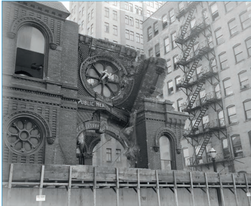
FIG. 1. A PHOTOGRAPH DOCUMENTING THE DEMOLITION OF THE PROVINCIALY SIGNIFICANT, FIRST HAMILTON PUBLIC LIBRARY, HAMILTON, ON, 1955.