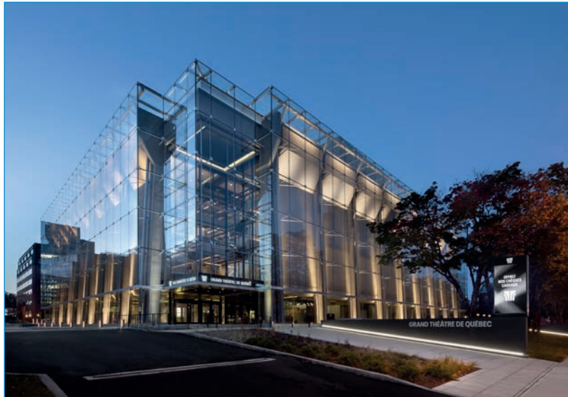
FIG. 18. THE RENOVATED GRAND THÉÂTRE DE QUÉBEC, QUEBEC CITY, QC, 2021, BY LEMAY AND ATELIER 21.

competition to address the challenge of severe weathering to the reinforced concrete structure. Lemay and Atelier 21's winning proposal added a protective shell of glass suspended in a complex steel armature 65 (fig. 18). The project won the 2021 Royal Architectural Institute of Canada Innovation Award; the jury commented: