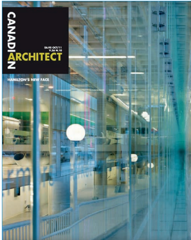
FIG. 13. COVER OF CANADIAN ARCHITECT, VOL. 56 NO. 10 (OCTOBER 2011): GLASS ADDITION TO HAMILTON'S CENTRAL LIBRARY & FARMERS' MARKET WITH VIEW INTO MARKET INTERIOR, 2011