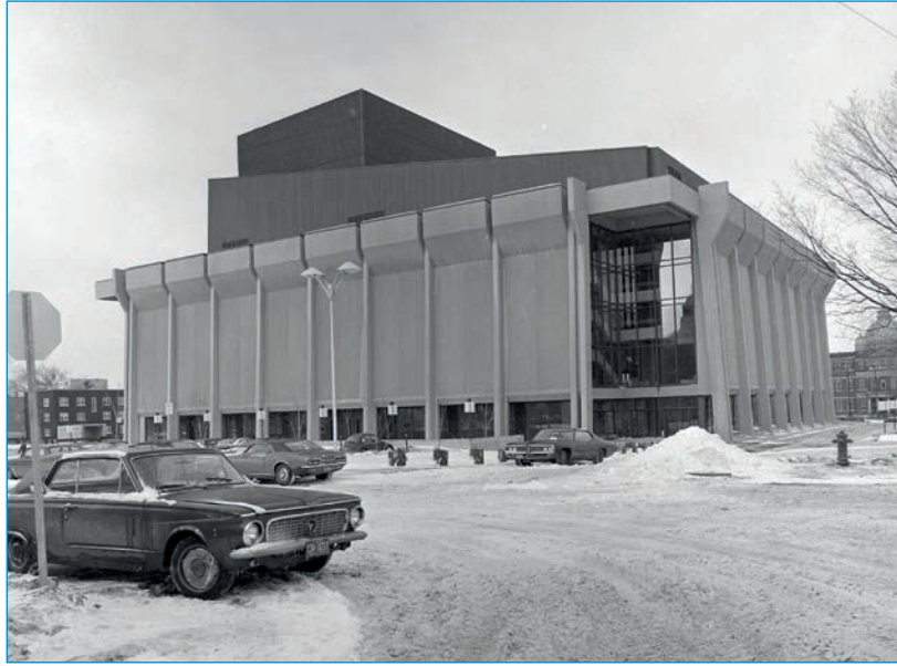
FIG. 17. A CANADIAN CENTENNIAL PROJECT, THE GRAND THÉÂTRE DE QUÉBEC, QUEBEC CITY, QC, C. 1971, BY VICTOR PRUS.