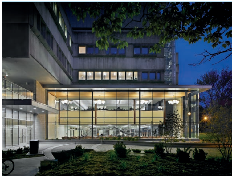
FIG. 11. JAN AND MIEN HEERSINK READING PAVILION, HEALTH SCIENCES LIBRARY, WITH THE MCMASTER UNIVERSITY HEALTH SCIENCES CENTRE, HAMILTON, ON, 2007, BY MCCALLUM SATHER ARCHITECTS.

to the megadevelopment, which cleared over one hundred early buildings from the historic core. 49 When it opened in 1980, a contemporary critic strongly approved of the design and focused on the interior space. Noting the building's strikingly "odd shape [...] like a slightly demented pyramid," critic Michael Quigley praised its "lightness" and "restraint," drawing a contrast with both the adjacent Jackson Square and the "eye-shocking abstract designs" inside Zeidler's MUMC. 50 Where the heavy "dark browns [of] Stelcoat facing" characterized the Jackson Square complex, which also includes Stelco Tower (C.F. Lau Architects, 1973), the 1980 structure was described in terms that ascribe to it a benevolent otherworldliness: "the library building is lighter: it looks less solid, less imposing, less dominating than the others, almost as if it could levitate itself." 51 The library interior was what mattered most to Quigley, whose approbation focused on the interior finishes, including concrete pillars, and the "gentle and restful" mood they created. 52