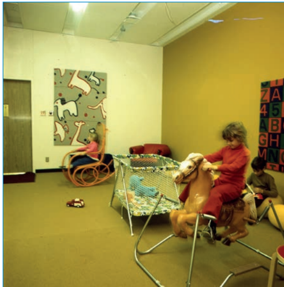
FIG. 9. CHILDREN SEEN IN A PLAY ROOM OF THE MCMASTER UNIVERSITY MEDICAL CENTRE, HAMILTON, ON, 1971, BY CRAIG, ZEIDLER & STRONG ARCHITECTS.