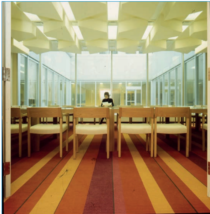
FIG. 5. INTERIOR VIEW OF THE MCMASTER UNIVERSITY MEDICAL CENTRE, HAMILTON, ON, 1971, BY CRAIG, ZEIDLER & STRONG ARCHITECTS.