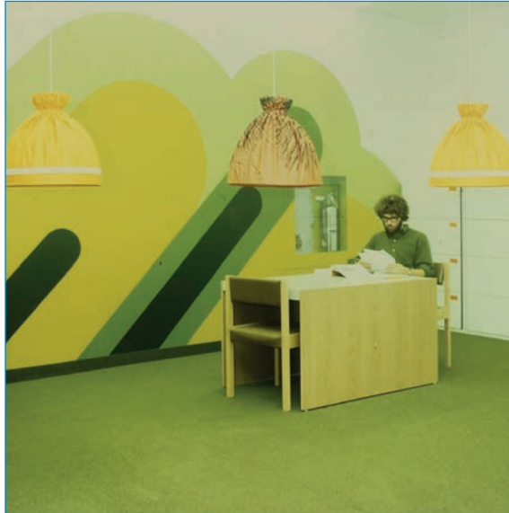
FIG. 8. A STUDENT SEATED IN THE LIBRARY OF THE MCMASTER UNIVERSITY MEDICAL CENTRE, HAMILTON, ON, 1971, BY CRAIG, ZEIDLER & STRONG ARCHITECTS.