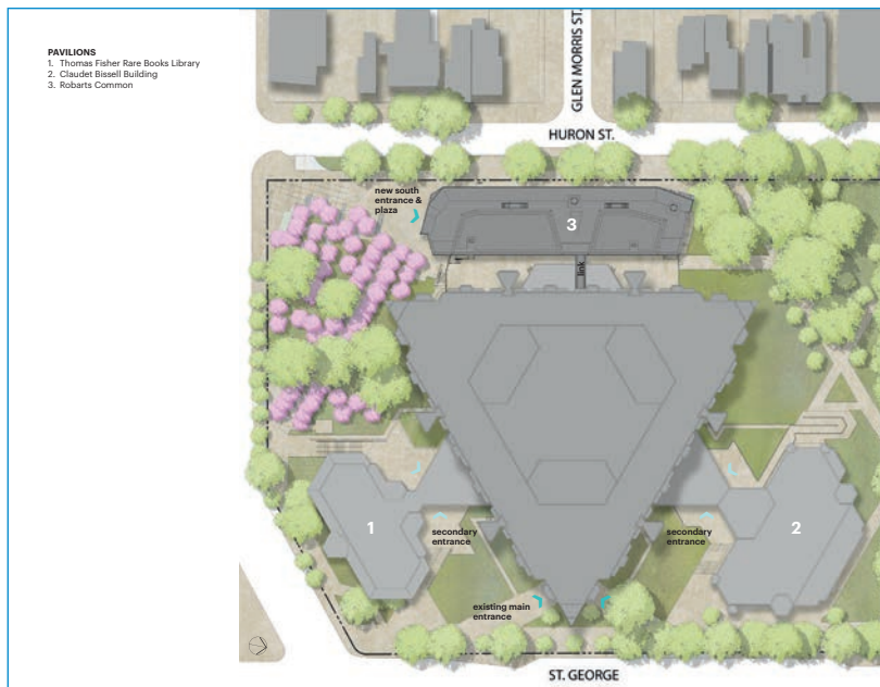
FIG. 16. ROBERTS LIBRARY WITH ROBERTS COMMON, 2021, BY DIAMOND SCHMITT ARCHITECTS.