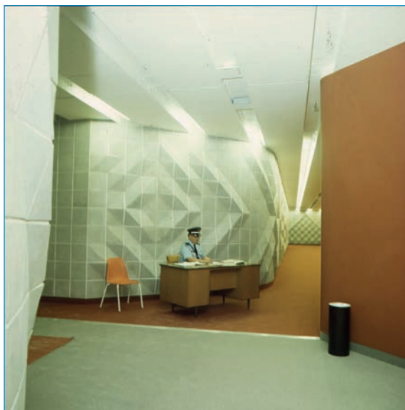
FIG. 10. A SECURITY GUARD SEATED BEFORE ONE OF ARTIST TED BIELER'S CONCRETE WALLS INSIDE THE MCMASTER UNIVERSITY MEDICAL CENTRE, HAMILTON, ON, 1971, BY CRAIG, ZEIDLER & STRONG ARCHITECTS.