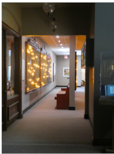
FIG. 3. ENTRANCE TO THE MEMORIAL LOUNGES FROM THE SOUTHWEST.