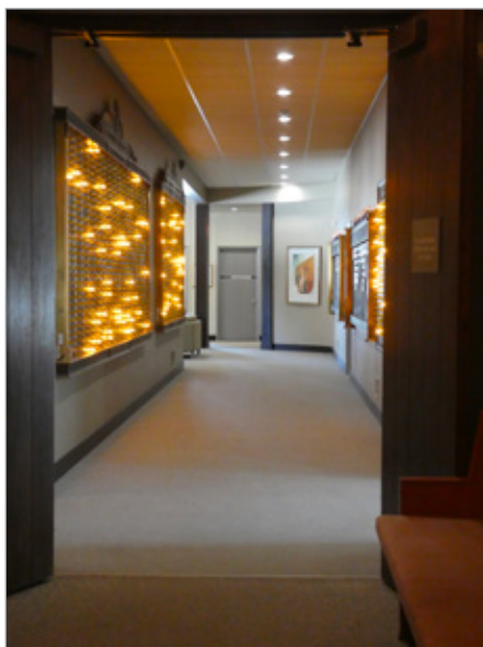
FIG. 2. ENTRANCE TO THE MEMORIAL LOUNGES FROM THE SOUTHEAST. | SHARON GRAHAM, FEBRUARY 2021.