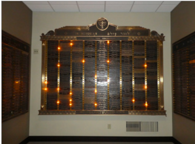
FIG. 5. EXAMPLE OF A MEMORIAL PLAQUE. | SHARON GRAHAM, FEBRUARY 2021.