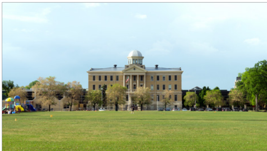
FIG. 12. ASPER JEWISH COMMUNITY CAMPUS, 123 DONCASTER STREET, WINNIPEG, MB.