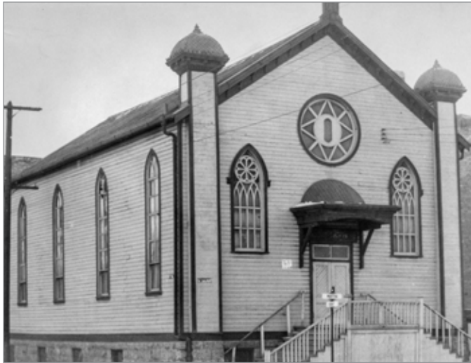
FIG. 7. EXTERIOR AND FRONT ENTRANCE OF ROSH PINA SYNAGOGUE (1893). | CREDIT JEWISH HERITAGE CENTRE OF WESTERN CANADA; PHOTO 30131.