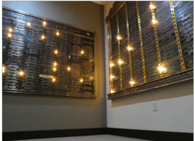
FIG. 6. A CHILD'S PERSPECTIVE IN A MEMORIAL LOUNGE ROOM.

there are plenty of classrooms and play spaces in this synagogue, including one spacious room in the basement with floor hockey equipment. Instead, they were meant as a compromise that would allow the members of the three merging synagogues feel as though they were acknowledged in the new Congregation Etz Chayim, which uses the former Rosh Pina building. Ensuring that the rooms for the memorial boards existed in a visible part of the synagogue was an integral part of the merger negotiations. 10 It seems, however, that this hanging of the memorial boards in their own rooms has resulted in removing them from the main spaces used by the congregation. At another Winnipeg synagogue, Congregation Shaarey Zedek, the memorial boards are located in the chapel which adjoins the main sanctuary and is used for many prayer services, allowing regular worshippers to sit in a pew which is close to their relatives' names on the boards. At the Winnipeg synagogue Adas-Yeshurun Herzlia, the memorial boards are hung on the back walls of the main sanctuary. Though the boards are too high up on the wall to see, the ancestors of members are included in the main prayer