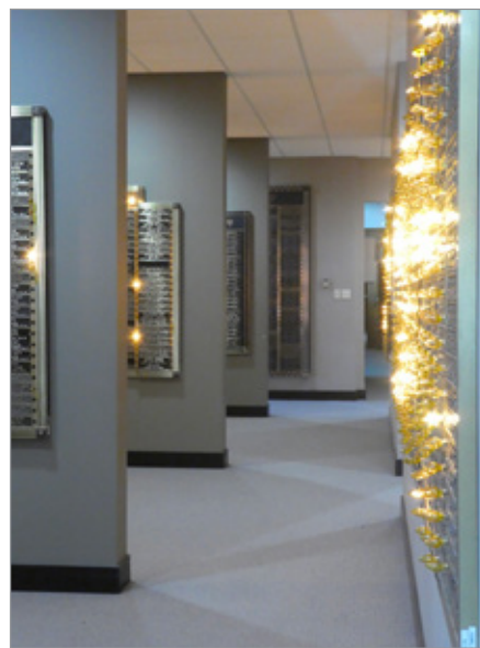
FIG. 4. CLOSE-UP OF THE PATH THROUGH THE MEMORIAL LOUNGES FROM THE SOUTH, ILLUSTRATING THE COMMEMORATIVE WALLS. | SHARON GRAHAM, FEBRUARY 2021.

this wing. The three rooms are divided like an upper-case letter E with an extra horizontal arm, with two walls, like two vertical dashes, standing next to them, thus making all the rooms open on one side. Figure 4 shows the edges of three of the four interior walls of the E-shaped construction which makes up the three rooms.