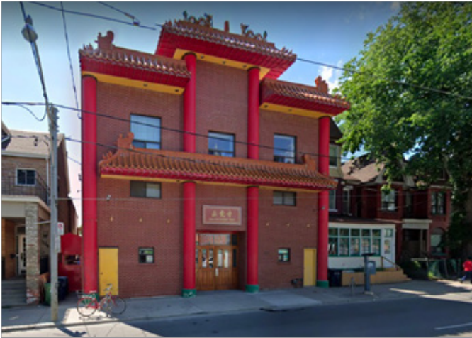
FIG. 5. THE CHINESE MAHAYANA PURE LAND BUDDHIST CHING KWOK TEMPLE (1992), 300 BATHURST STREET, TORONTO, ON. | GOOGLE MAPS: [HTTPS://WWW.GOOGLE.COM/MAPS/@43.6507928,-79.4053877,3A,90Y,269.14H,89.05T/DATA=!3M7!1E1!3M5!1SY5GGYBCTNSVSZ-CSF5Q80A!2E0!5S-20180701T000000!7!16384!8!18192], ACCESSED AUGUST 24, 2021.