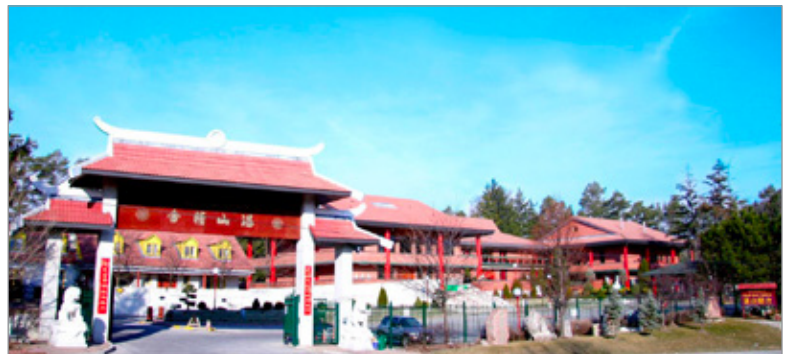
FIG. 10. THE BUDDHIST ASSOCIATION OF CANADA'S CHAM SHAN TEMPLE COMPLEX, 7254 BAYVIEW AVE., THORNHILL, ON. | BUDDHIST ASSOCIATION OF CANADA CHAM SHAN TEMPLE: [HTTP://EN.CHAMSHANTEMPLER.ORG/MESSAGES/ABOUTUS/INDEX.PHP?CHANNELID=8&SECTIONID=117&LANGCD=EN&ITEMID=87], ACCESSED APRIL 5, 2021.