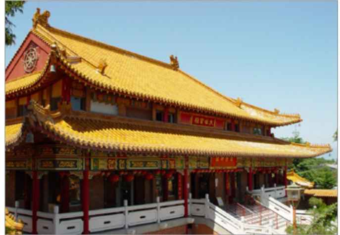
FIG. 6. THE INTERNATIONAL BUDDHIST SOCIETY TEMPLE, 9160 STEVESTON HIGHWAY, RICHMOND, BC, EPITOMIZES A SUCCESSFUL MARRIAGE OF WESTERN CONSTRUCTION METHODS AND THE TRADITIONAL NORTHERN CHINESE STYLE OF PALATIAL ARCHITECTURE.

roofing in a patently Chinese architectural style highlight the Mahāyāna Pure Land sanctuary's symmetrical red brick façade. 36 As Victoria Yau has observed, "[u]se of strong primary colours on building exteriors is a special feature of Chinese architecture." 37