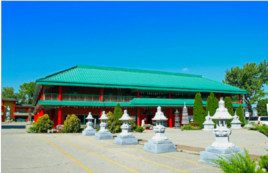
FIG. 14. ADJACENT TO THE BUDDHIST ASSOCIATION OF CANADA'S TEN THOUSAND BUDDHAS SARIRA [RELICS] STUPA, THE CONTRASTING HALL OF FIVE CONTEMPLATIONS TEMPLE, 4303 RIVER ROAD, NIAGARA FALLS, ON.

metres tall and weighing seven tons, which was fashioned in China, shipped to Canada in pieces and reassembled on site. A more modest two-storey building, the Hall of Five Contemplations Temple contrasts markedly with the stūpa (fig. 14). Painted in bright red, yellow, and green, the structure includes a worship hall, rooms for meditation and meetings, offices, a gift shop, a vegetarian restaurant and kitchen, a museum, and a library. The second floor provides accommodation for monks and nuns. Statues and paintings of bodhisattvas and Buddhist worthies may be found throughout the building. Also painted red, yellow, and green, the Guan Yin Pavilion features a gracious figure of the bodhisattva Avalokiteśvara in eponymous female form, posed upon a lotus flower pedestal as the patroness of mothers and the protectress of babies and infants (fig. 15).