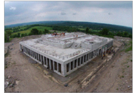
FIG. 19. THE STEEL AND REINFORCED CONCRETE LOWER LEVELS AND PLATFORM OF THE MAIN DHARMA HALL AT THE WUTAI SHAN BUDDHIST GARDEN, 708 SKI HILL ROAD, BETHANY, ON. | BUDDHIST ASSOCIATION OF CANADA'S CHAM SHAN TEMPLE: [HTTP://THEBUDDHISTGARDEN.COM/GALLERY%E7%9B%B8%E7%89%87%E9%9B%86/MAIN-HALL-CONCRETE-FOUNDATION%E5%A4%A7%E6%AE%BF%E6%B0%B4%E6%B3%A5%E5%9F%BA%E7%A4%8E%E5%BB%BA%E8%A8%AD/], ACCESSED APRIL 5, 2021.

mingjian at the front of the building are two hundred and fifty fèn in height. 70 The proportional distance between columns applies throughout the entire structure, since the cai module "works not only for bracketing, columns, windows and doors, eaves and rafters, but also for beams, purlins, and the entire timber frame." 71 In the Great East Hall, the thirty-six pillars are arranged in an eight-by-five configuration, with four pillars removed to make room for the main altar. 72 On top of the pillars are interlocking brackets sets, or puzuo , more commonly known in later architectural treatises of the Ming and Qing dynasties as dougong , meaning literally "cap and block." 73 The intercolumnar bracket sets of the Great East Hall feature the most complicated system from the Tang dynasty. With a total of seven varieties, this formation deploys four tiers of arms and two cantilevers. The system provides not only structural support but also connects the crossbeams with the column joists in the post-and-beam design, transferring the load of the eaves to the vertical pillars in layers of horizontal bracketing. Each bracket set measures around two metres and one half in height, which is approximately half the height of the column. Crescent beams are used to join the bracket arms, while a special feature of Tang architecture