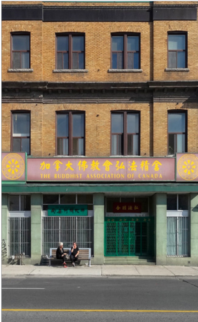
FIG. 11. THE BUDDHIST ASSOCIATION OF CANADA'S HONG FA TEMPLE, 1330 BLOOR STREET WEST, TORONTO, ON.

The BAC continued to expand its services in Toronto and in other parts of Ontario. In 1984, they purchased a twenty-thousand-square-foot, three-storey mixed commercial and residential building at 1330 Bloor Street West in Toronto and, in another example of repurposing, transformed it into the Hong Fa Temple (fig. 11). A decade or so later, the BAC opened the thirty-thousand-square-foot Cham Shan Buddhist Gallery and Library at 1224 Lawrence Avenue West.