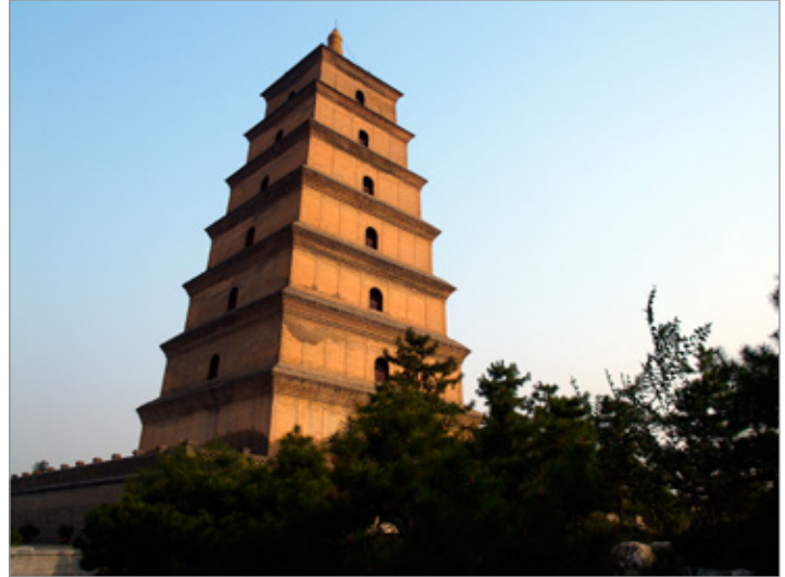
FIG. 12. THE FAMOUS GIANT WILD GOOSE PAGODA IN XI'AN, CHINA, ERECTED DURING THE TANG DYNASTY [618-907] AND RESTORED SEVERAL TIMES OVER THE CENTURIES, MOST RECENTLY IN 1964.

Although a lack of visitors has led to its closure, the building housed Buddhist texts, sculptures, and art, offered dining facilities, and hosted lectures and other events related to the transmission of Buddhist teachings. In 2002, by contrast, the BAC completed a more successful project in Niagara Falls, Ontario. Acquired in 1995, a three-acre site at 4303 River Road, near the Whirlpool Rapids Bridge, contains three structures of architectural interest: the Ten Thousand Buddhas