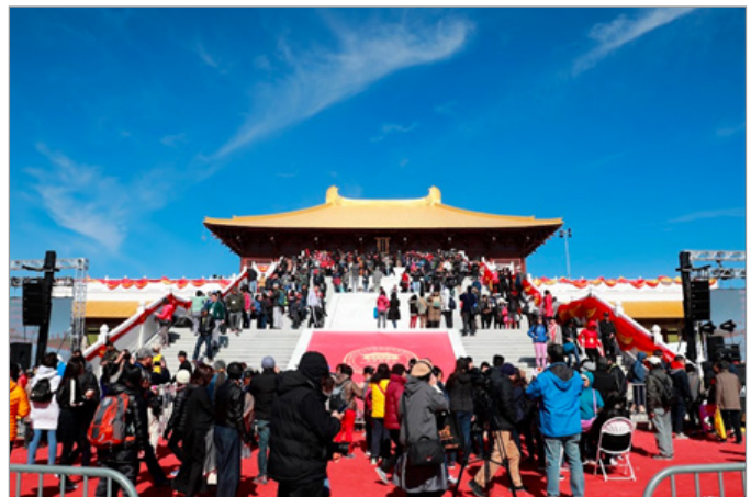
FIG. 25. ON OCTOBER 5, 2019, A CONSECRATION CEREMONY FORMALLY SANCTIFIED THE MAIN DARMA HALL AT THE WUTAI SHAN BUDDHIST GARDEN, 708 SKI HILL ROAD, BETHANY, ON.

and decorated, a consecration ceremony formally sanctified the main Dharma Hall on October 5, 2019 (figs. 24 and 25).