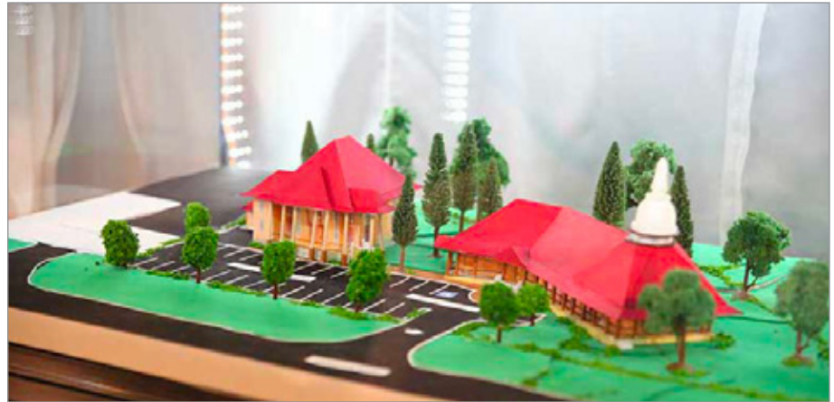
FIG. 2. AN ARCHITECTURAL MODEL OF THE THERAVADA TORONTO MAHAVIHARA BUDDHIST TEMPLE (RIGHT) AND THE NEW EXTENSION UNDER DEVELOPMENT (LEFT), 4698 KINGSTON ROAD, SCARBOROUGH, ON.

We have seen how Jōdo Shinshū first established a particular form of Pure Land Mahāyāna Buddhism across Canada. An influx of immigrants from Burma, India, and Sri Lanka led to the founding of Canada’s first Theravadin Buddhist house of worship. 21 Formed in 1973, the Canadian Buddhist Vihara Society (CBVS) cherished “the noble idea of establishing a Buddhist temple in the Sri Lankan Theravāda tradition in Toronto.” 22 Early temples in Sri Lanka were built in rural locales and often at the highest point of the area. Subsequently, temples for urban devotees have been constructed