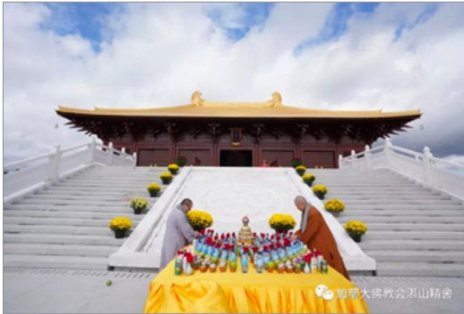
FIG. 20. THE BUDDHIST ASSOCIATION OF CANADA'S MAIN DHARMA HALL AT THE WUTAI SHAN BUDDHIST GARDEN, 708 SKI HILL ROAD, BETHANY, ON. | BUDDHIST ASSOCIATION OF CANADA'S CHAM SHAN TEMPLE: [HTTP://THEBUDDHISTGARDEN.COM/], ACCESSED APRIL 5, 2021.