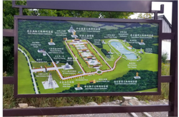
FIG. 29. A CONCEPTUAL RENDERING OF THE LOCATION OF THE PRINCIPAL BUILDINGS, STATUARY, AND LANDSCAPE FEATURES OF THE WUTAI SHAN BUDDHIST GARDEN, 708 SKI HILL ROAD, BETHANY, ON. | EMILY J. GILBERT, AUGUST 2021.

platform, Amoghasiddhi, the wisdom of perfect conduct. Fifth, Vairocana, the wisdom of the true nature of Dharma , stands on the central platform in line south to north between the main Dharma Hall and the massive figure of the Buddha which crowns the rising topography. About six kilometres long, the Bodhi Path and tributary trails link the five statues of Mañjuśrī with one another and with the main entrance gate, the main Dharma Hall, and the Wisdom Lake (fig. 29).