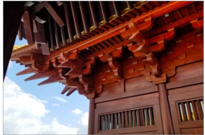
FIG. 21. AN EXTERIOR CLOSE-UP OF THE DOUGONG BRACKET SETS, MORTISE-AND-TENON CARPENTRY AND POST-AND-BEAM CONSTRUCTION USED IN THE MAIN DHARMA HALL AT THE WUTAI SHAN BUDDHIST GARDEN, 708 SKI HILL ROAD, BETHANY, ON. | EMILY J. GILBERT, AUGUST 2021.

It provides space for storage, too. Over eight thousand square feet, the middle level contains the mechanical room and washrooms, as well as changing rooms for participants in prayer services. Erected on the uppermost level, the main Dharma Hall reiterates the Great East Hall of the Foguang Temple (fig. 20). Also totalling more than eight thousand square feet, this sanctuary was designed to host all important liturgical occasions. Mimicking the Great East Hall, the main Dharma Hall features a seven-bay façade, and the dougong techniques of traditional Tang Chinese carpentry and construction have been employed throughout the build (fig. 21). In another vein, architects took careful note of the devotional geometry of the Tang building: as Liang observes, for example, the feet of the main Buddha statue are at eye level and the ceiling at a thirty-degree angle for devotees standing in the mingjian doorframe at the Great East Hall, while the Buddha's head presents at a thirty-degree angle for devotees standing inside the front entrance of the inner colonnade. The architecture of the main Dharma Hall recapitulates this devotional geometry.