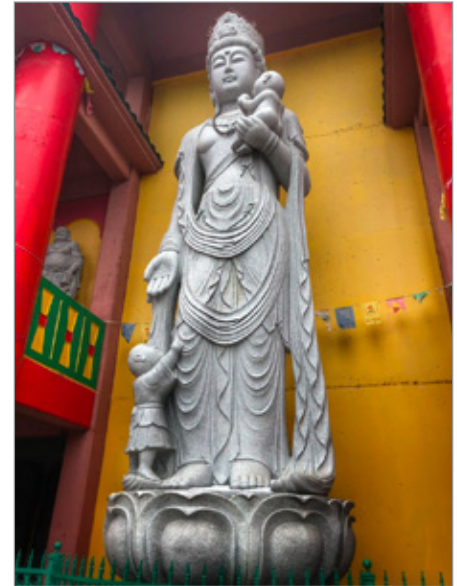
FIG. 15. COMPLEMENTING THE BUDDHIST ASSOCIATION OF CANADA'S TEN THOUSAND BUDDHAS SARIRA [RELICS] STUPA, THE GUAN YIN PAVILION HOUSES THE BODHISATTVA AVALOKITEŚVARA IN EPNOMYOUS FEMALE FORM, 4303 RIVER ROAD, NIAGARA FALLS, ON.