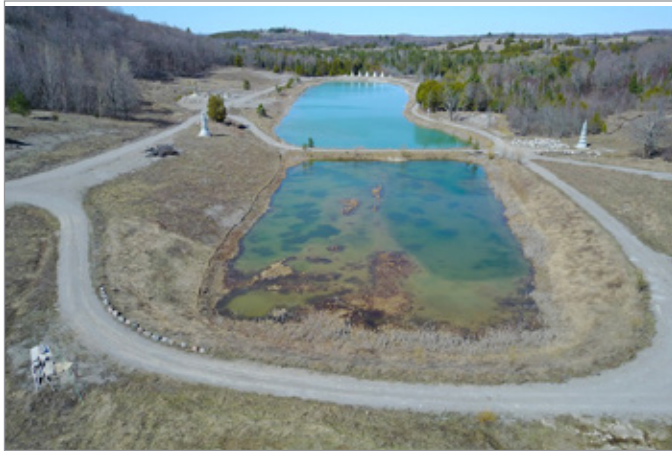
FIG. 28. CREATING WISDOM LAKE AT THE WUTAI SHAN BUDDHIST GARDEN, 708 SKI HILL ROAD, BETHANY, ON.