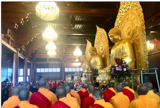
FIG. 24. THE INTERIOR OF THE MAIN DARMA HALL AT THE WUTAI SHAN BUDDHIST GARDEN, 708 SKI HILL ROAD, BETHANY, ON.