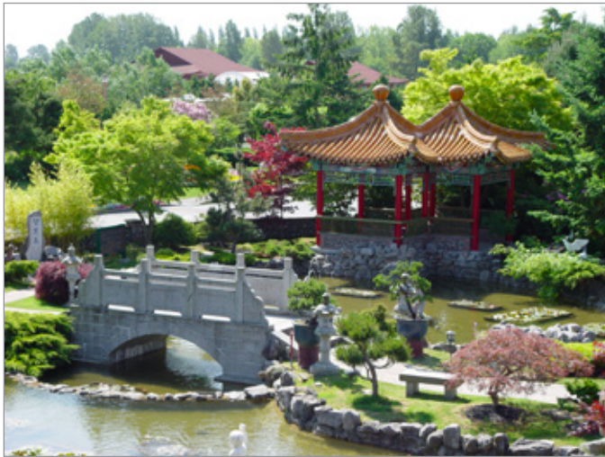
FIG. 7. THE GARDENS AT THE INTERNATIONAL BUDDHIST SOCIETY TEMPLE, 9160 STEVESTON HIGHWAY, RICHMOND, BC.