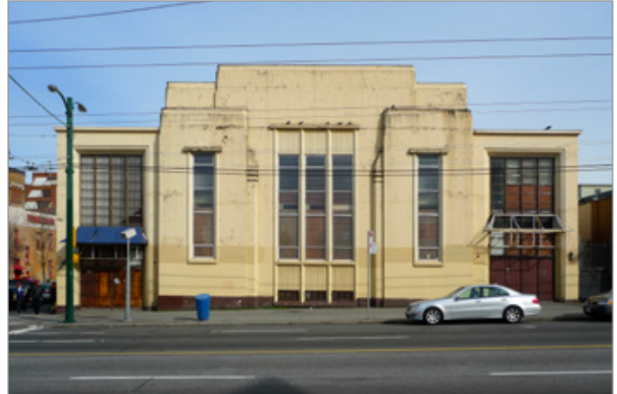
FIG. 4. FROM 1985 TO 1993, THE CHINESE CHAN GOLD BUDDHA MONASTERY OCCUPIED THE SALVATION ARMY TEMPLE (1949), BUILT IN THE MODERNE STYLE AT 30 EAST HASTINGS STREET, VANCOUVER, BC.