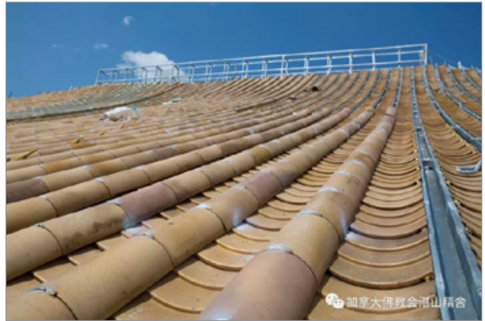
FIG. 23. COPPER TILES COVER THE ROOF THE MAIN DARMA HALL AT THE WUTAI SHAN BUDDHIST GARDEN, 708 SKI HILL ROAD, BETHANY, ON.