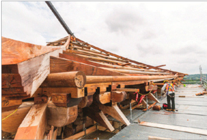
FIG. 22. UNDER CONSTRUCTION, THE ROOF OF THE MAIN DARMA HALL AT THE WUTAI SHAN BUDDHIST GARDEN, 708 SKI HILL ROAD, BETHANY, ON.