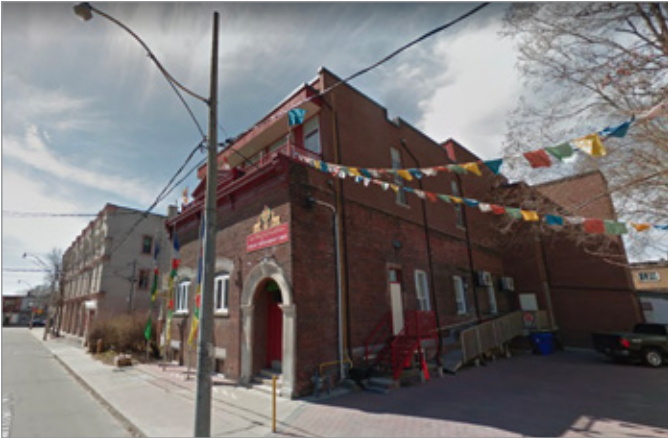
FIG. 3. THE RIWOCHÉ TIBETAN BUDDHIST TEMPLE, 28 HEINTZMAN AVENUE, TORONTO, ON. | GOOGLE STREET VIEW: [HTTPS://WWW.GOOGLE.CA/MAPS/@43.6661944,-79.4636207,3A,75Y,201.55H,104.65T/DA=13M711E113M511S98CFTY5EPLGGZNYEN6TVGG12E015520150401T0000001711331218166567HL=EN], ACCESSED AUGUST 24, 2021.