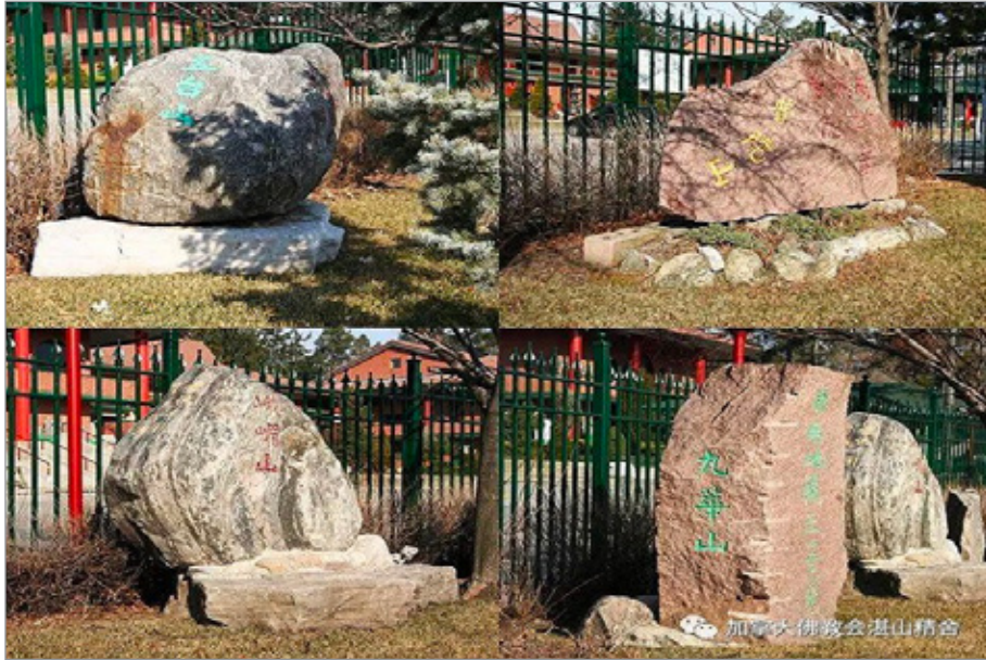
FIG. 16. INSCRIBED WITH THE NAMES OF THE BODHISATTVAS AVALOKITEŚVARA, MAÑJUŚRĪ, SAMANTABHADRA, AND KṢITIGARBHA, FOUR BOULDERS STAND OUTSIDE THE GATE OF THE BUDDHIST ASSOCIATION OF CANADA'S CHAM SHAN TEMPLE, 7254 BAYVIEW AVE. THORNHILL, ON.

monks had the rocks inscribed with the names of four bodhisattvas . These inscriptions reflect their understanding of the BAC's mission to practice and promote the compassion of the bodhisattva Avalokiteśvara, the wisdom of the bodhisattva Mañjuśrī, the conduct of the bodhisattva Samantabhadra, and the resolve of the bodhisattva Kṣitigarbha. In that regard, Chinese Buddhist tradition holds that these four bodhisattvas make their homes at four sacred mountains: Mañjuśrī at Wutai Shan, or the Mountain of Five Plateaus; Avalokiteśvara at Putuo Shan, or the Mountain of Brilliance; Kṣitigarbha at Jiuhua Shan, or the Mountain of Nine Glories; and Samantabhadra at Emei Shan, or the Mountain of the Delicate Brows. Located at a distance from one another, the four mountains symbolically encompass the cardinal geography of China: Emei Shan is located in Sichuan province in the west; Putuo Shan in Zhejiang province in the east; Wutai Shan in Shanxi province in the north; and Jiuhua Shan in Anhui province,