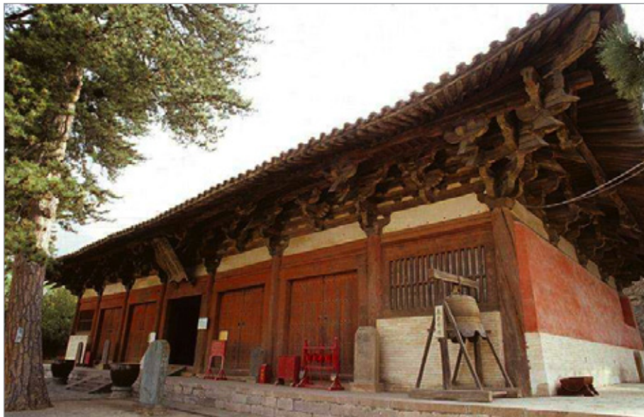
FIG. 17. A VIEW OF THE GREAT EAST HALL OF THE FOGUANG TEMPLE IN SHANXI PROVINCE, CHINA.

ponds, and other landscaping, as well as statues of bodhisattvas , various Buddhist worthies, and stone carvings of auspicious fauna. Da Yi and the BAC have received support from both the Canadian and Chinese governments, as well as generous donations from Buddhist communities in Canada and overseas.