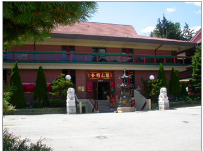
FIG. 8. THE BUDDHIST ASSOCIATION OF CANADA'S CHAM SHAN TEMPLE, 7254 BAYVIEW AVE., THORNHILL, ON. | BUDDHIST ASSOCIATION OF CANADA CHAM SHAN TEMPLE: [HTTP://EN.CHAMSHANTEMPLER.ORG/MESSAGES/ABOUTUS/INDEX.PHP?CHANNELID=8&SECTIONID=109&ITEMID=87&ATTACHID=0&LANGCD=EN], ACCESSED APRIL 5, 2021.