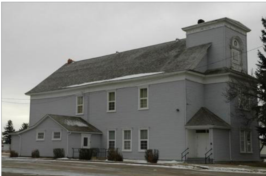
FIG. 1. THE RAYMOND BUDDHIST CHURCH, 35 BROADWAY AVENUE, RAYMOND.