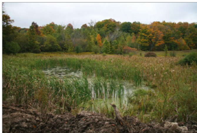
FIG. 27. BEFORE EXCAVATION, WOODLAND AND WETLAND AT THE WUTAI SHAN BUDDHIST GARDEN, 708 SKI HILL ROAD, BETHANY, ON. | BUDDHIST ASSOCIATION OF CANADA'S CHAM SHAN TEMPLE: [HTTP://THEBUDDHISTGARDEN.COM/GALLERY%E7%9B%B8%E7%89%B7%E9%9B%86/WISDOM-LAKE-%E9%9D%88%E6%B3%89%E6%B9%96/], ACCESSED APRIL 5, 2021.

Literally meaning “clear, cool mountain,” qingliang became an alternative name for the peak, following the Avatamsaka sutra , which associates the term with the earthly abode of Mañjuśrī. 81 Both the Mañjuśrī Hall and the Guanyin Hall, however, will be erected directly to the south of the main Dharma Hall. With indoor areas between five thousand and seven thousand square feet, these structures function as initiatory spaces through which devotees and other visitors may pass as they ascend northward to the main Dharma Hall. Interestingly, the alignment of these three halls does not mirror the placement of buildings at the Foguang Temple complex. Most Chinese temples are oriented on a north–south axis. The Great East Hall, however, faces west: thus positioned, it does not turn its back on the mountain abodes of the revered Mañjuśrī that rise in the north, south, and east (fig. 26). By contrast, the topography of the Wutai Shan Buddhist Garden site and surrounding lands permits the main Dharma Hall, the Mañjuśrī Hall, and the Guanyin Hall to be aligned north to south without incurring inauspicious connotations.