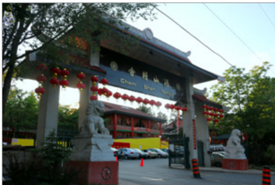
FIG. 9. KNOWN AS A PAIFANG, THE TRADITIONAL ENTRANCE TO THE BUDDHIST ASSOCIATION OF CANADA'S CHAM SHAN TEMPLE, 7254 BAYVIEW AVE., THORNHILL, ON. | CREATIVE COMMONS ATTRIBUTION-SHAREALIKE 3.0 UNPORTED LICENSE: [HTTPS://UPLOAD.WIKIMEDIA.ORG/WIKIPEDIA/COMMONS/C/C2/CHAM_SHAN_TEMPLE_-_A_CHINESE_TEMPLE_IN_TORONTO_-_CANADA_-_2014.JPG], ACCESSED APRIL 5, 2021.