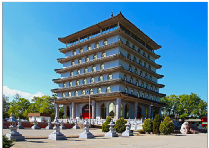
FIG. 13. THE BUDDHIST ASSOCIATION OF CANADA'S TEN THOUSAND BUDDHAS SARIRA [RELIQS] STUPA, 4303 RIVER ROAD, NIAGARA FALLS, ON.

Sarira [Relics] Stupa, the Hall of Five Contemplations Temple, and the Guan Yin Pavilion. Dedicated to world peace, the predominantly grey stūpa rises seven storeys in the manner of the renowned Giant Wild Goose Pagoda in Xi'an, China (figs. 12 and 13). 48 It houses relics of the Buddha, as well as numerous Buddhist artifacts from China, Thailand, Tibet, and Vietnam, including the Grand Bell of World Peace. 49 Most notably, the stūpa encompasses a bronze Buddha twelve