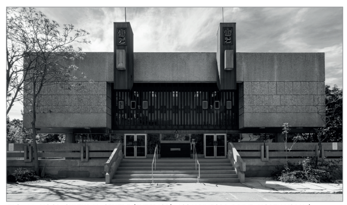
FIG. 11. NOOR CULTURAL CENTRE (EXTERIOR), 123 WYNFORD DRIVE, NORTH YORK. | THOMAS GUIGNARD, 2017, CC BY-NC-SA 2.0, WWW.FLICKR.COM, ACCESSED MARCH 20, 2020.