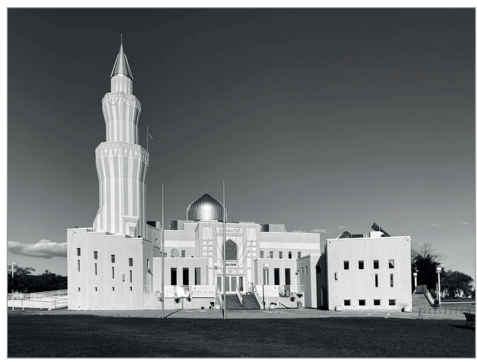
FIG. 4. BAITUL ISLAM MOSQUE, 10610 JANE ST, VAUGHAN. | SAADMAN AHMED, 2020.

attract prejudice from local non-Muslim citizens. One such case occurred in 1995 in an Ontario Municipal Board meeting, when a Toronto resident representing his supporters spoke out angrily against a mosque proposal, arguing: "There is no comparison to that kind of building in Canada. It is going to be a foreign, exotic building . . . If they put up this minaret and dome, it will act like a calling card for the whole community."16 The visible character of mosques commonly attracts vandalism, such as the anti-Arabic graffiti on a York region mosque,17 urination on a Markham mosque,18 food thrown at an Owen Sound mosque,19 and countless other cases across North America. Apart from the social discrimination against Muslims, these conflicts occur due to citizens not being accustomed to the traditional Islamic architectural languages that are being created as symbolic markers for a minority group. With the expressive mosques, although immigrant Muslims essentially create an appearance which satisfies an emotional condition that has historical efficacy, some key questions must be asked as part of the discourse: How is the image of the mosque affecting the future generations of Muslims