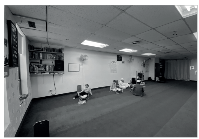
FIG. 6. DANFORTH ISLAMIC CENTRE (INTERIOR), 3018 DANFORTH AVE, EAST YORK. | SAADMAN AHMED, 2019.