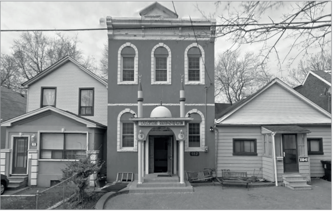
FIG. 8. FATIH MOSQUE, 182 RHODES AVE, TORONTO. GOOGLE STREET VIEW, 2017, ACCESSED MARCH 15,

religious lectures, community centres, and often become cultural hubs for various events. Although repurposed mosques do not always express their culture through design, they nonetheless use parts of the idioms and ideas of traditional Islamic architecture and values, whether programmatically or contextually. Yet, this duality of repurposed mosques raises several questions: Do the repurposed mosques simply convey "an essentialized version of mosque architecture or do they successfully claim a sense of architectural authenticity?" <sup>23</sup> Are the subtle representations of culture behind the façades of