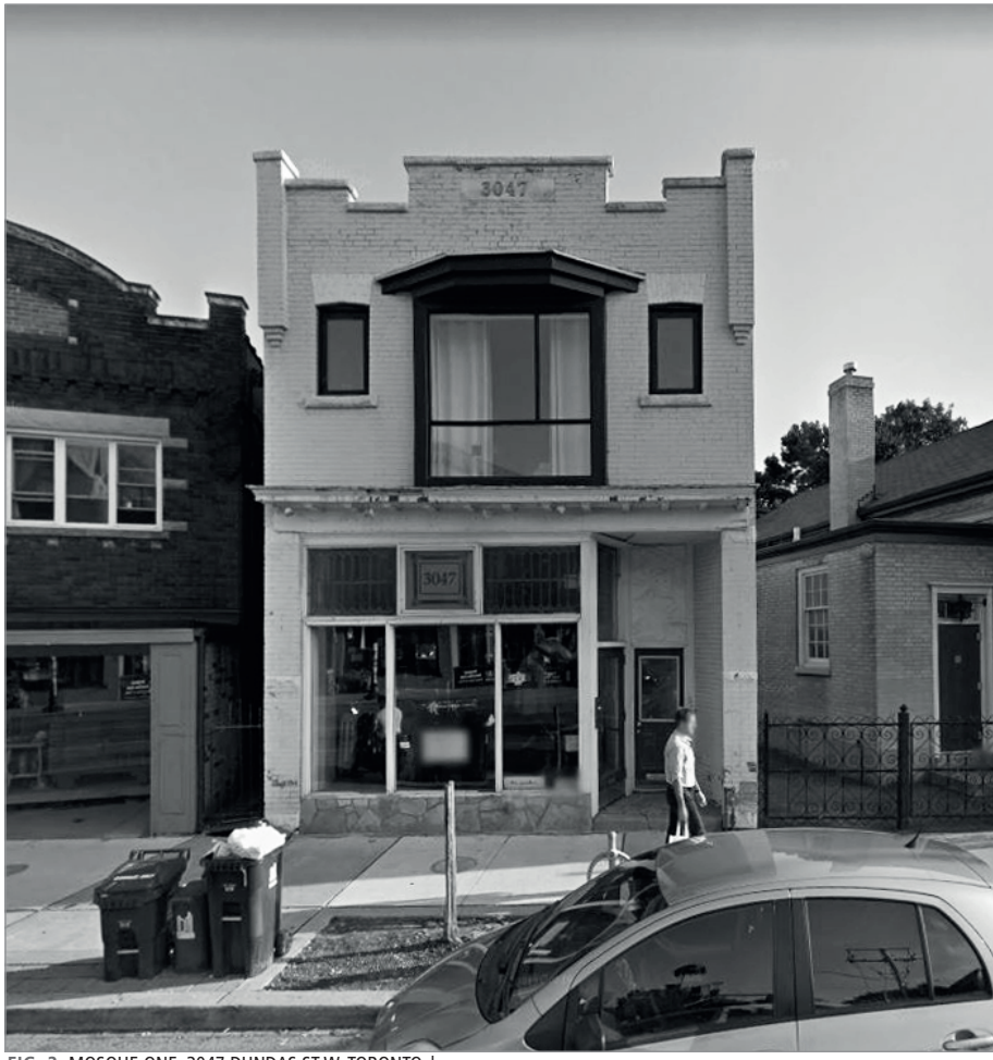
FIG. 2. MOSQUE ONE, 3047 DUNDAS ST W, TORONTO.

in the same space with the men. Besides a prayer area, the mosque included a small library and a Sunday school, designed to help children to preserve their cultural and religious identity.<sup>10</sup>