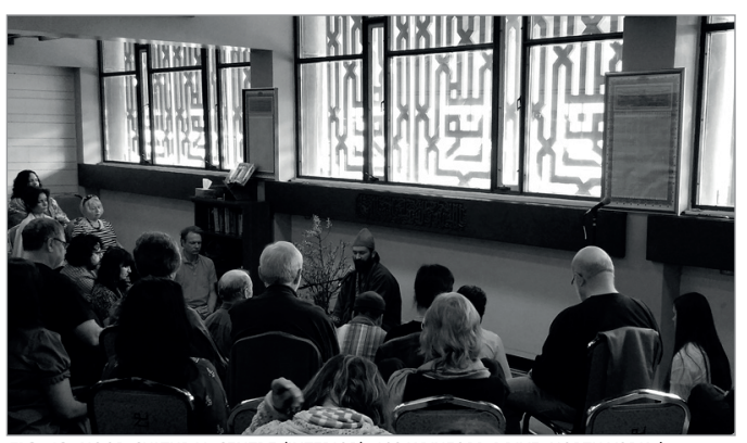
FIG. 12. NOOR CULTURAL CENTRE (INTERIOR), 123 WYNFORD DRIVE, NORTH YORK.

York, ON, we can begin to understand the need to create a Canadian identity for Muslims living and practicing their faith in Canada.