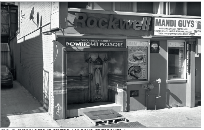
FIG. 7. SHEIKH DEEDAT CENTRE, 100 BOND ST, TORONTO.