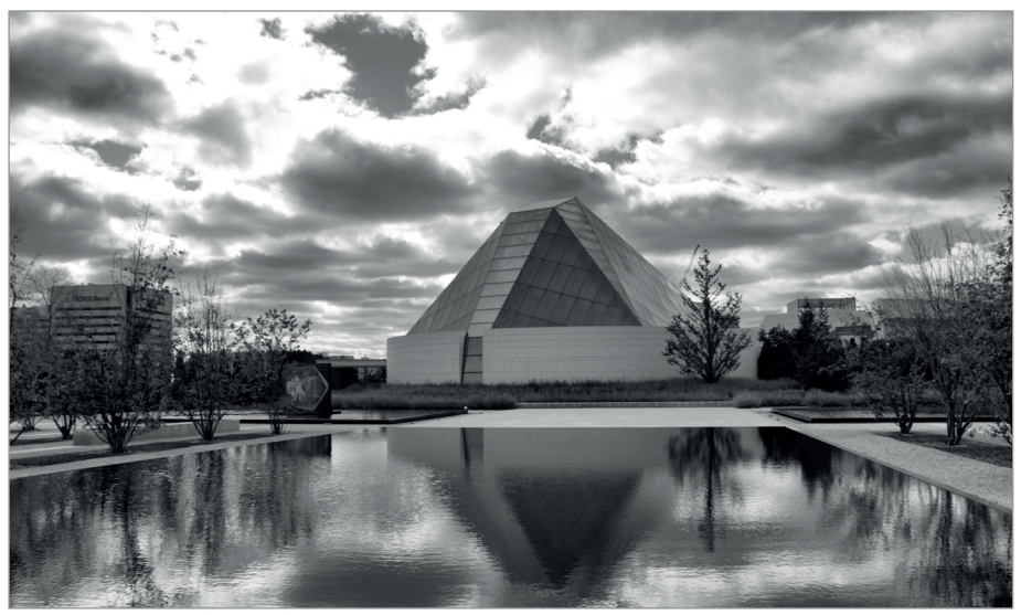
FIG. 9. ISMAILI CENTRE (EXTERIOR), 49 WYNFORD DRIVE, NORTH YORK.