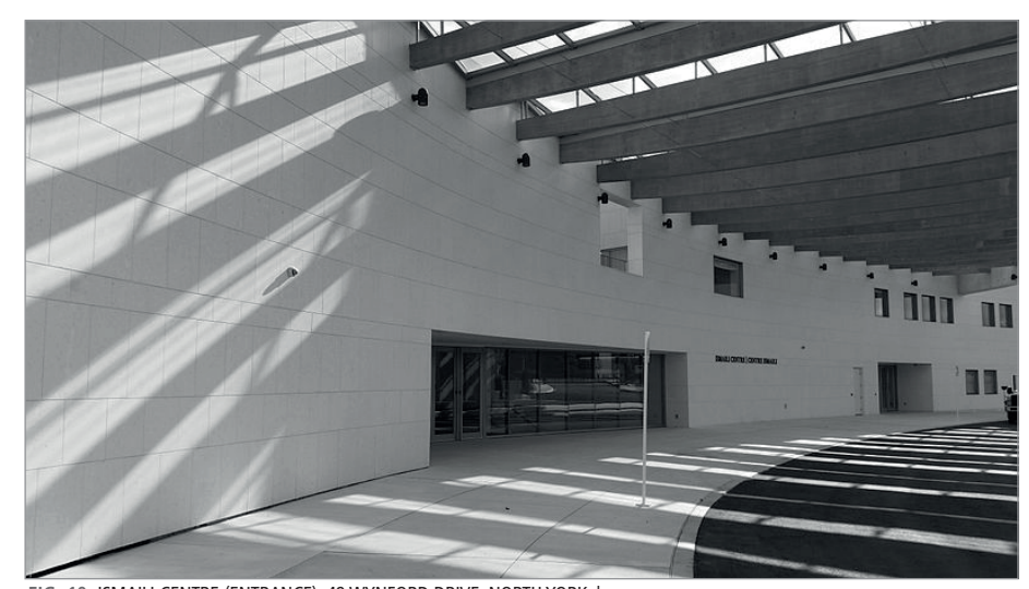
FIG. 10. ISMAILI CENTRE (ENTRANCE), 49 WYNFORD DRIVE, NORTH YORK.