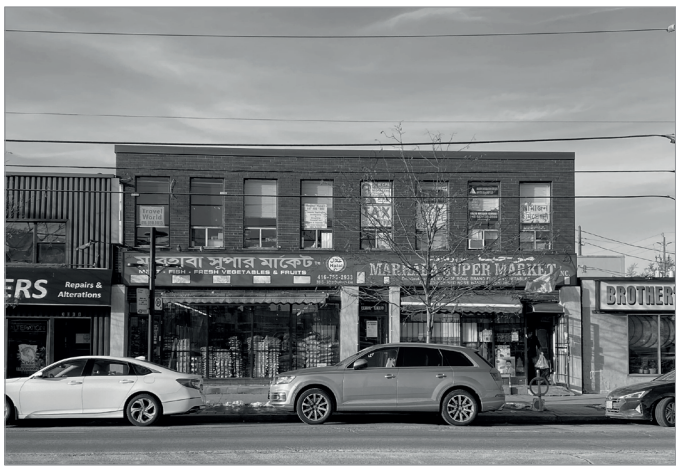
FIG. 5. DANFORTH ISLAMIC CENTRE (EXTERIOR), 3018 DANFORTH AVE, EAST YORK. | SAADMAN