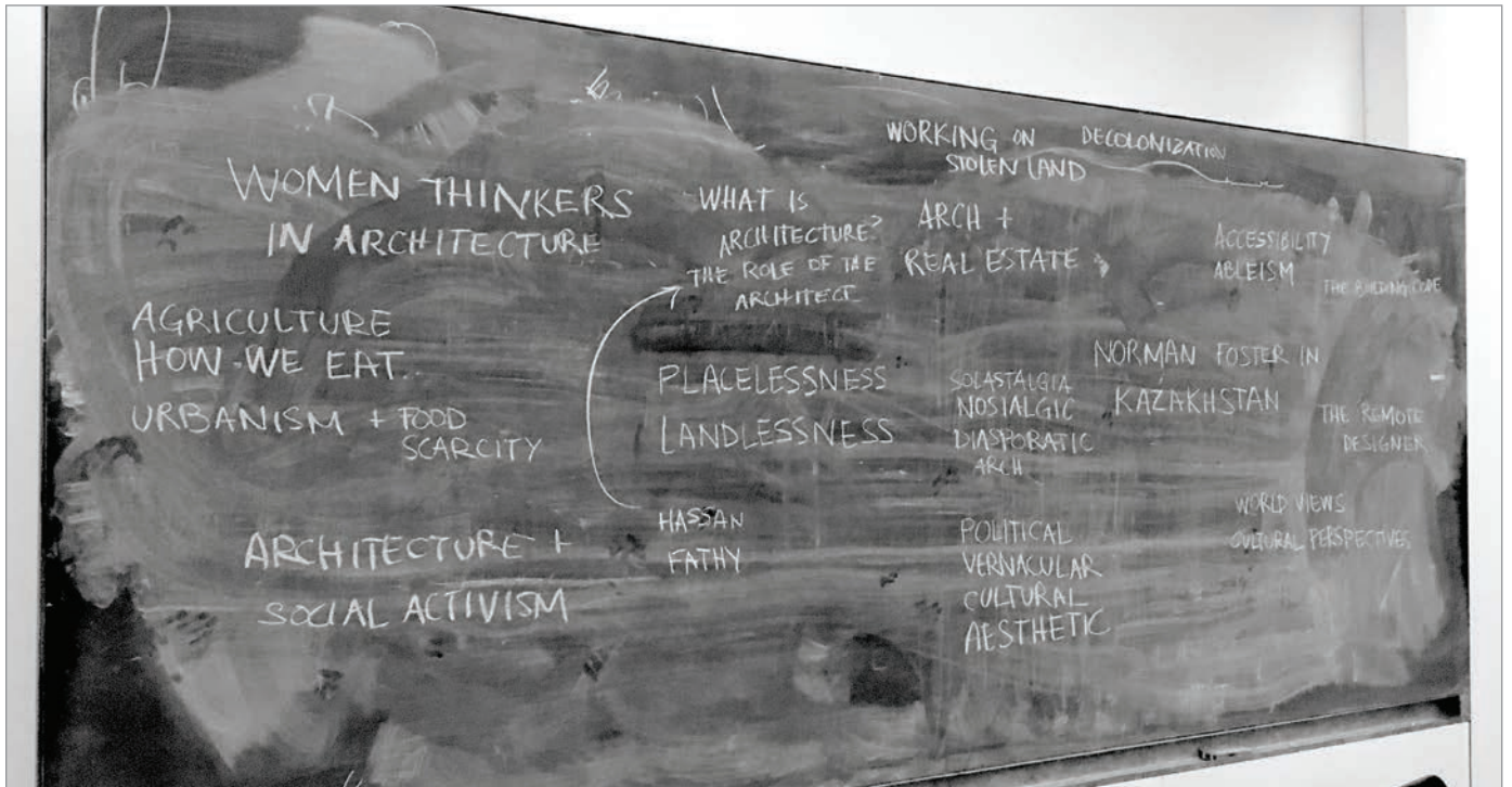
FIG. 3. COURSE TOPIC BRAINSTORMING DURING THE 'EXPANSION PACK' SYLLABI WORKSHOP.

The following sections provide a summary of our findings from each of the above inquiries. We view our research as a preliminary investigation, laying the groundwork for Canada-specific research and action that we, and others, may pursue. We share it here to encourage other scholars and students to continue this work of understanding and questioning the cultural pedagogy of architectural education in this country.