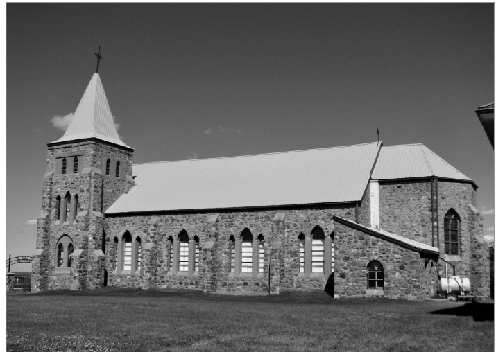
FIG. 6. VIEW OF THE SOUTH SIDE OF KAPOSVAR ROMAN CATHOLIC CHURCH, KAPOSVAR, RM 183, SK (1906-1907). UNKNOWN ARCHITECT, PIROT STONEMASONS.

narrative held within the façade showed unlimited ambition for the future of the congregation and the colony, one on par with the highest glories of their homeland.