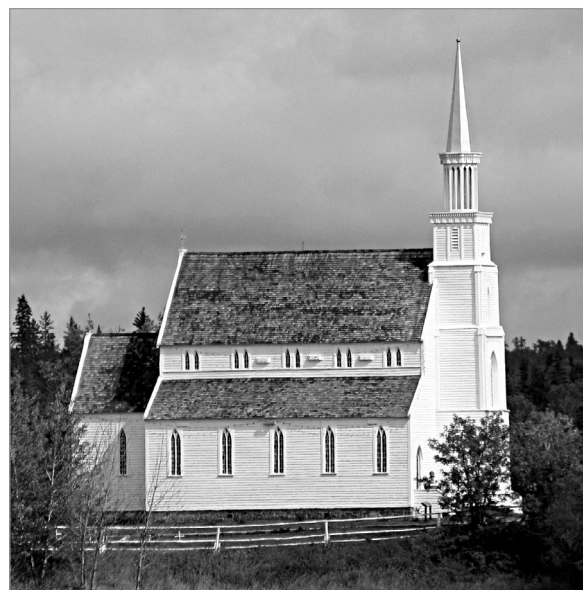
FIG. 8. VIEW OF THE SOUTH SIDE OF HOLY TRINITY ANGLICAN CHURCH, STANLEY MISSION, SK (1854-1860). UNKNOWN ARCHITECT.