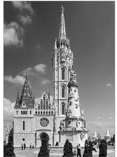
FIG. 4. VIEW OF THE WEST FAÇADE OF MATTHIAS CORONATION CHURCH, BUDAPEST, HUNGARY (14 TH CENTURY).

Evidence of the congregation’s involvement in the construction of the church is found in the particulars of the design of the façade, where links to the great churches of their native homeland are evident. The most likely source of inspiration was the great coronation Church of Our Lady (Matthias) in Budapest (fourteenth century, fig. 4). The general massing of the façade, with the northern tower being substantially lower than the southern one is quite similar, albeit simpler in design (figs. 1 and 4). It was common for churches to begin construction with the