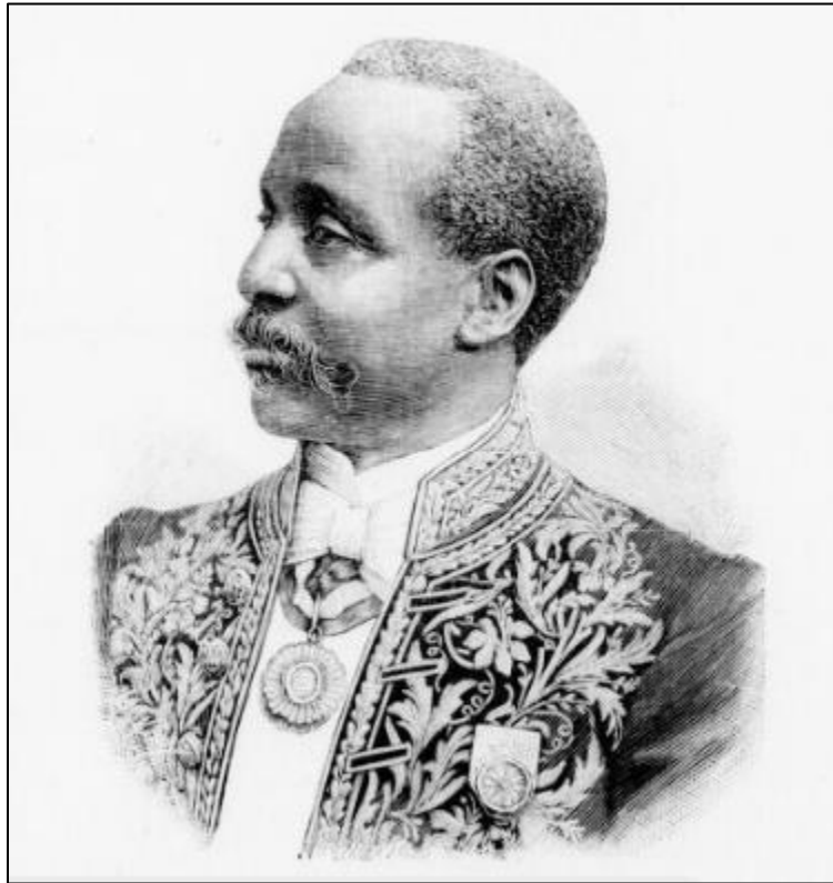
Figure 1. Joseph Anténor Firmin on the cover of Le Moniteur .