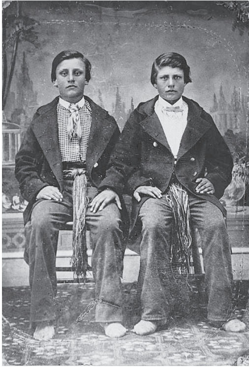
Figure 2: Joseph and Charles Riel, Winnipeg, 1871