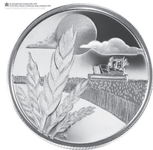
Figure 4: Gold coin commemorating the 100 th Anniversary of Marquis Wheat, 1903-2003.