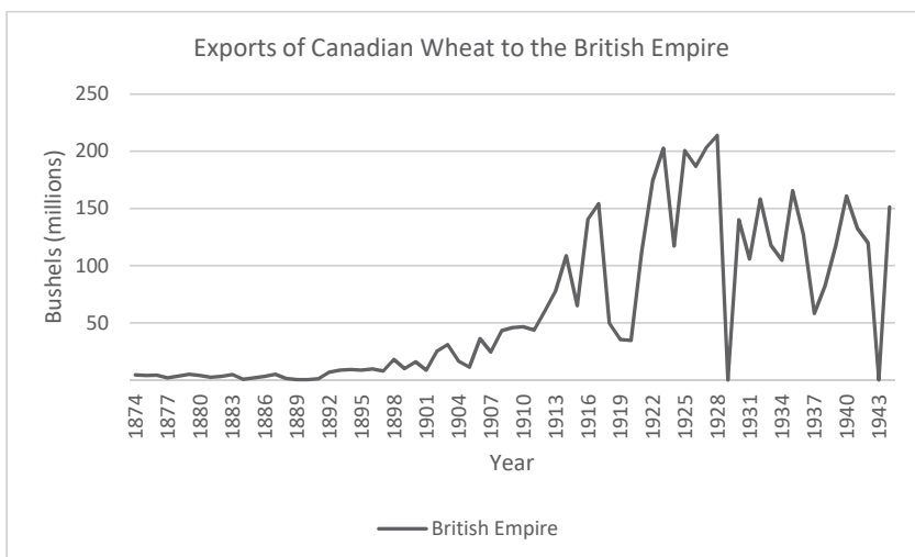
Figure 2: Exports of Canadian Wheat to the British Empire over time. Dominion Board of Statistics – Board of Grain Commissioners for Canada, Courtesy of the Canadian Grain Commission. 87

The modernization of Canadian agriculture allowed it to compete with other wheat producing countries such as the United States, Australia, and Argentina. Aside from sparse population and a harsh climate, Canadian wheat production was constrained by the sheer distance involved in bringing Canadian wheat to market. Varty, for one, states that Argentine wheat traveled an average of 320 km from farms to the country's principal centres of consumption while in Australia the average distance from growing areas to consumption and shipping points totalled 300 km. 15 For Canada, an average of 2440 km distanced centres of consumption within the country from cultivable land in the West. 16 In addition to these hurdles, a similar distance remained before Canadian wheat cleared the inland shipping system entirely. 17 Indeed, the distance wheat travelled to and from ports onward into the global market was one of the most substantial issues plaguing Canadian wheat sales. The distance wheat travels within the country to reach outbound shipping ports remains a significant logistical issue to this day.