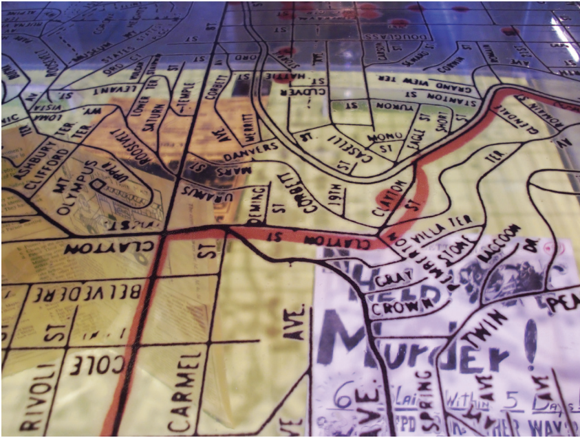
Figure 2: Aspects of the “Bearing the Scars” case at the GLBT History Museum, 2014

tourists, queer people, non-queer people, and school groups. 52 For the most part, the people who get the opportunity to make contact with these captivating objects are not those who would usually visit community archives. Unlike visitors' experiences in many modern museums, the way "Our Vast Queer Past" staged these archival objects was also reminiscent of the experience of archival encounters.